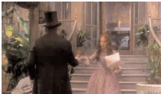
Figure 5: Violetta, with Mr. Germont

This repentance of Violetta will serve of argument so that Germont demands the removal of the life of Alfredo. Violetta insists nevertheless “ Lui solo amar vogl'io ” (I want to love only him), before which Germont, strikes a luck of final stab.