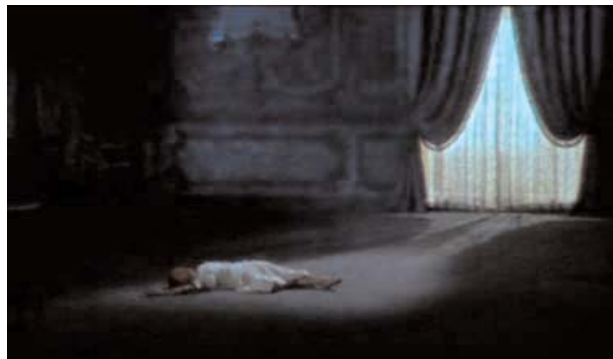
Figure 6: Violetta’s death

This repentance of Violetta will serve of argument so that Germont demands the removal of the life of Alfredo. Violetta insists nevertheless “ Lui solo amar vogl'io ” (I want to love only him), before which Germont, strikes a luck of final stab.