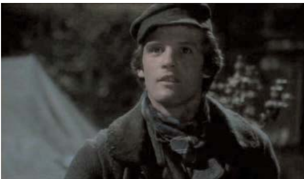
Figure 1: A fascinated boy

Based on Dumas's text where he relates the auction of Maruerite's belongings (Verdi changed the name of the protagonists, Marguerite of Dumas in the opera takes the name of Violetta), one of the youths in charge of moving the furniture remains fascinated (figure 1) by a portrait of Violetta (figure 2), who at the same time observes the scene and tries to withdraw from this past humor. The characters that initially appear like ghosts turn to reality at the beginning of the first act. The party describes the