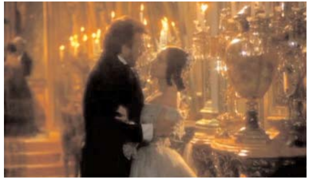
Figure 3: After the toast, the love

general playful bewilderment and alcoholism that have taken refuge in the Parisian society. The removal of the cigarette factory worker by one of the other guests illustrates the superficiality of the supposed ties of friendship. Very they are achieved two effects that Zeffirelli introduces toward the end of the act when Violetta remains in silence before its own aria Ab, fors' è lui ...and the momentary apparition of Alfredo in the part of Sempre libera .