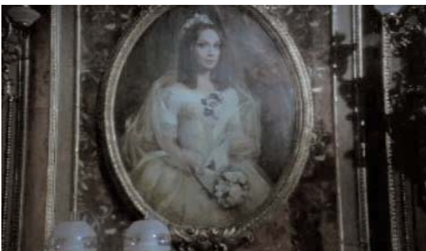
Figure 2: The portrait of Violetta