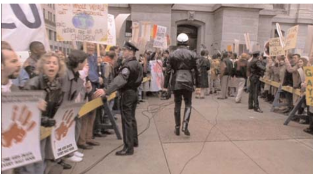
Figure 12: Social reaction

In the movie, we see how the Andrew's denouncement of his superiors has repercussions at the social level that go beyond the issue of an unfair dismissal; rather it is an act of protest against the treatment that HIV-infected individuals and homosexuals receive from others simply for having their "condition". Thus, during the trial we see ardent protests both in favour of and against both social groups (figure 12). The prejudices of the general population impose themselves on HIV/AIDS-infected persons: a social death that precedes real, physical death, inevitable in those times.