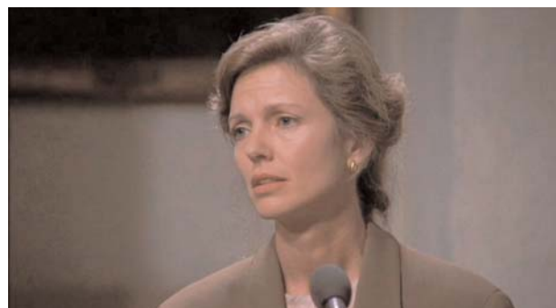
Figure 1: The witness who acquired VIH infection through a transfusion

Regarding receivers of blood transfusions, one of the witnesses in the trial, an employee of a law firm in another city, was also infected with HIV and had developed AIDS. This witness contracted the disease after delivery when she and lost a lot of blood and needed transfusions, resulting in her becoming infected (figure 1).