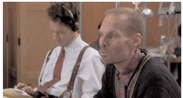
Figure 10: Isolating himself from his surroundings

The attitude of Andrew towards AIDS patients at the beginning of the movie is anything but positive. When he goes to see the doctor, he does not care about any one else and blocks his surroundings out with his work and his music (figure 10). This attitude, however, appears to change. In fact, one very emaciated patient with whom he coincides in the waiting room of a hospital and with whom he has never exchanged a single word goes to his funeral and survives him. These two cases are examples of the different ways that the AIDS evolves.