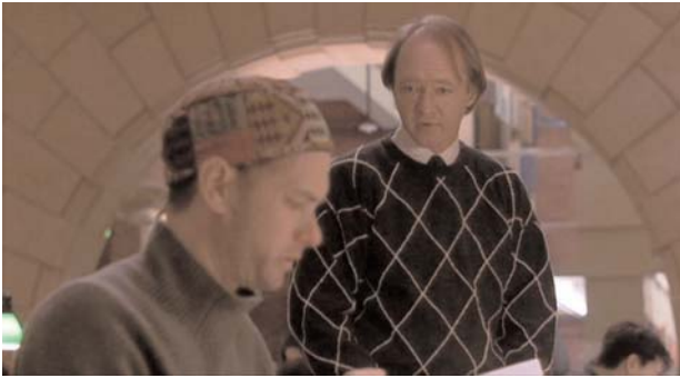
Figure 11: Discriminación

In the movie, we see how the Andrew's denouncement of his superiors has repercussions at the social level that go beyond the issue of an unfair dismissal; rather it is an act of protest against the treatment that HIV-infected individuals and homosexuals receive from others simply for having their "condition". Thus, during the trial we see ardent protests both in favour of and against both social groups (figure 12). The prejudices of the general population impose themselves on HIV/AIDS-infected persons: a social death that precedes real, physical death, inevitable in those times.