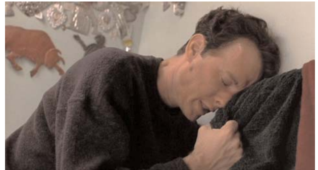
Figure 4: Digestive manifestations of AIDS

alised malaise. Along the trial we see how his physical status gradually deteriorates: continuing weight loss, weakness, muscle pain, lipodystrophy, giddiness and hair whitening (figure 5).