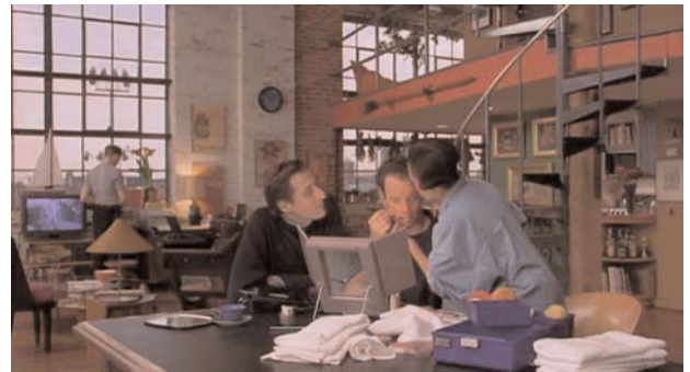
Figure 7: Hiding the disease

AIDS elicits important changes in Andrew's social environment. With respect to his professional life, at the beginning of the story he has excellent relations with his co-workers, both his professional colleagues and secretaries and bosses, who appreciate him as a professional, value his work, and who are on the point of making him partner in the law firm. However, this relationship changes when they find out that he suffers from AIDS and is a homosexual, issues that Andrew has kept secret. To conceal the disease, he even wears make-up and misses work, doing everything possible so that the others won't notice (figure 7). But his bosses dismiss him, repulsed by homosexuals (with the exception of one of the bosses, who along the film, we might suspect, could have AIDS himself) and terrified by the disease. They have had contact with him, even a certain intimacy, every day and probably fear they could have become infected themselves. They believe that Andrew must have contracted the illness by engaging in rash, torrid, and morally reprehensible sexual conduct. To hide this dis-