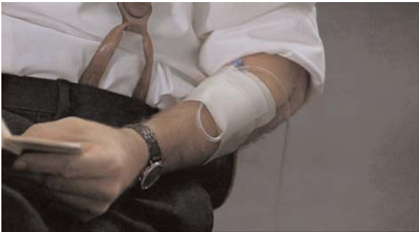
Figure 2: Analytical tests

a few years, and the movie begins just at the moment when he already knows that he is infected and is carrying out periodic checkups on his immunologic status (T lymphocyte, platelet counts, etc.). The disease continues its course until Andrew develops Acquired Immunodeficiency Syndrome (AIDS), which manifests along the action in the form of opportunistic infections and neoplastic pathologies. His analyses underscore the value of CD4 cell counts (figure 2).