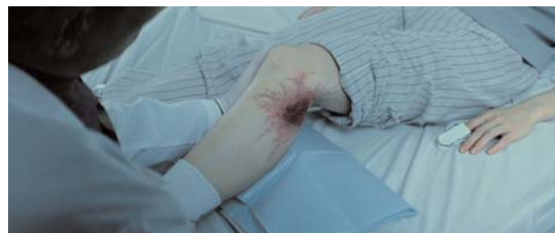
Figure 10: Infection of the skin and soft tissues which make amputation necessary

In the face of this situation and against his own beliefs, Frankie finally agrees to take her life.