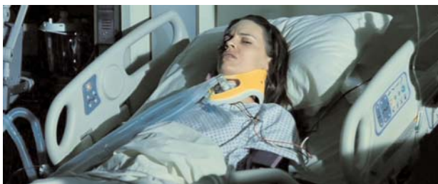
Figure 8: Maggie in the ICU

In a conversation with Eddie, when he asks Maggie if she is in pain and she answers no, the loss