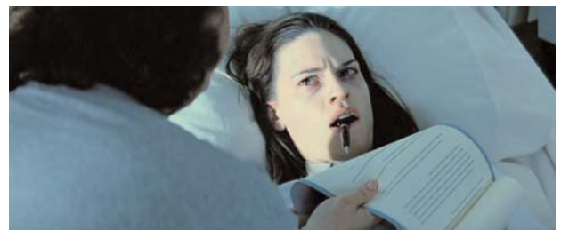
Figure 9. Physical disability

Two months go by before they can move her; as her position cannot be changed bedsores appear;