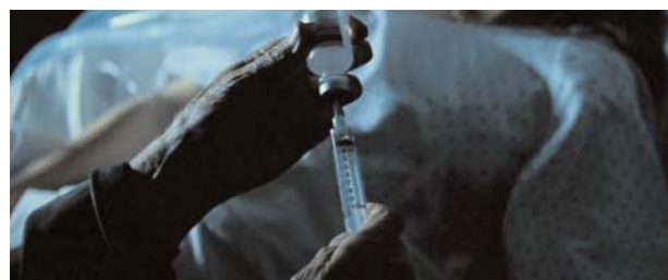
Figure 11: Adrenaline to cause cardiac arrest

In western societies, euthanasia (from the Greek eu good and τανασια death) is currently a topic of debate, when not of confrontation. It is a “hot potato” that politicians have on their desks. For its detractors it is an ethical problem, for its defenders a right and for medicine a bioethical matter, with toxicological and forensic implications. For these reasons this core of the plot has been intelligently chosen; it has pulling power, it arouses passions and involves the spectator's feelings 2 . But in the film it is an individual who carries it out, not a doctor.