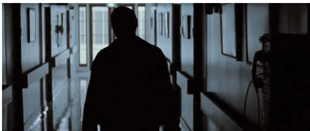
Figure 12: Under cover of darkness