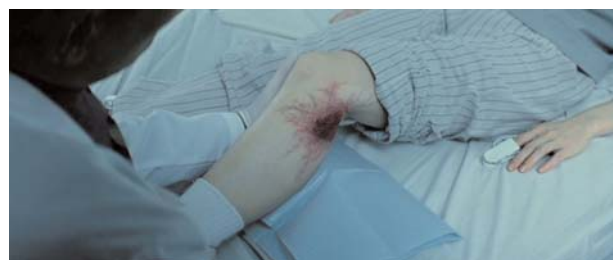
Figure 10: Infection of the skin and soft tissues which make amputation necessary

In the face of this situation and against his own beliefs, Frankie finally agrees to take her life.