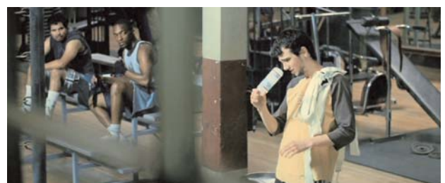
Figure 7: Danger

In both the plot and its medical analysis Maggie's quadriplegia is the most significant aspect.