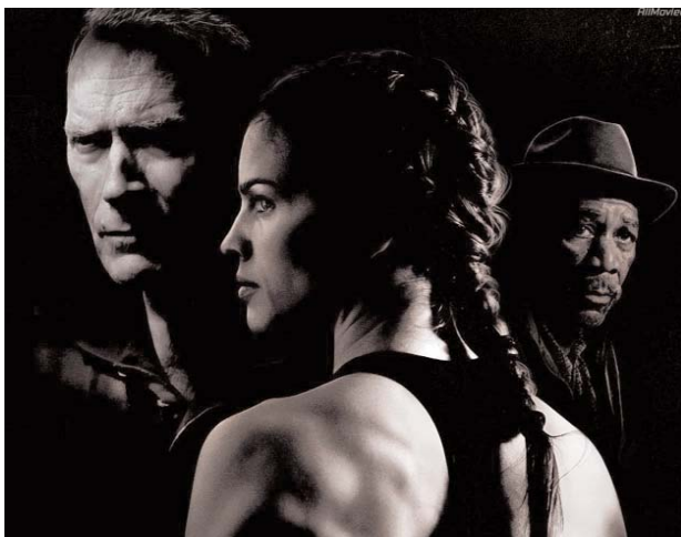
Figure 1: The main characters, Frankie, Maggie and Eddie

and its dénouement, although Frankie's importance in the plot is greater since the story revolves around this time of his life. Another three characters have a significant impact on the development of the plot, one present, Eddie "Scrap-Iron" Dupris, the main secondary character, an old boxer who takes care of cleaning Frankie's gym –he even lives there. He is played by Morgan Freeman (figure 1). The other two are only mentioned, Frankie's daughter and Maggie's father.