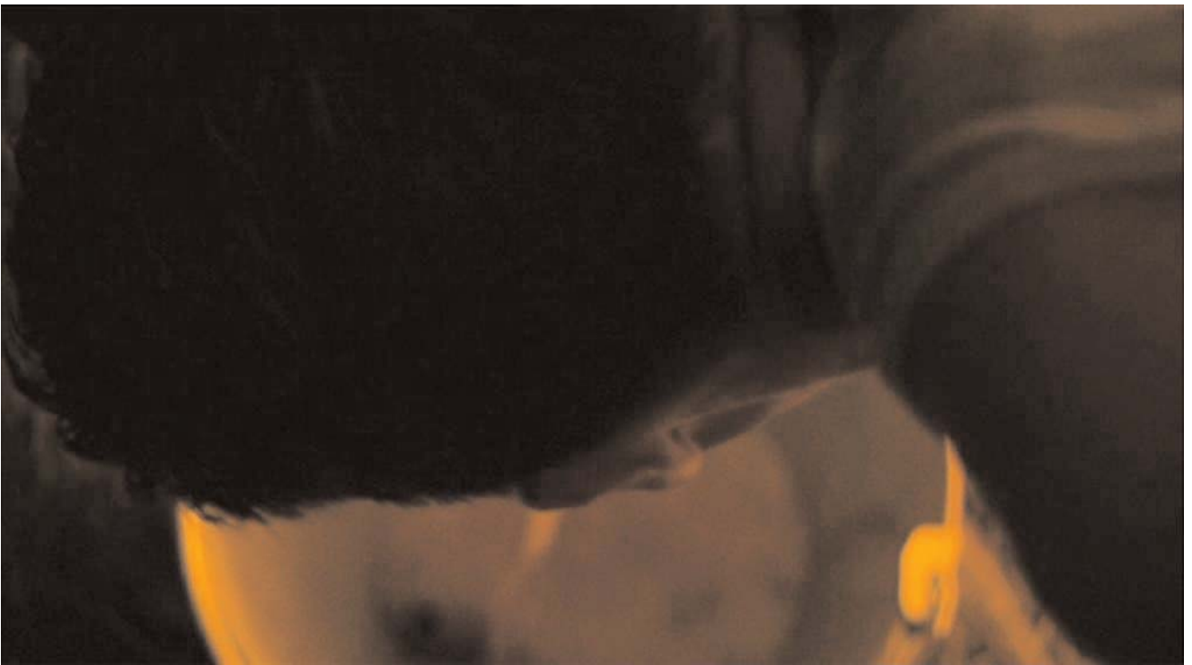
Clinical picture: Vomiting