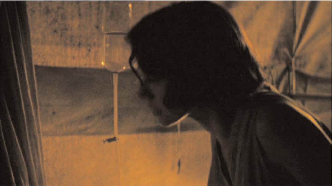
Treatment: Rehydration (water and electrolytes)