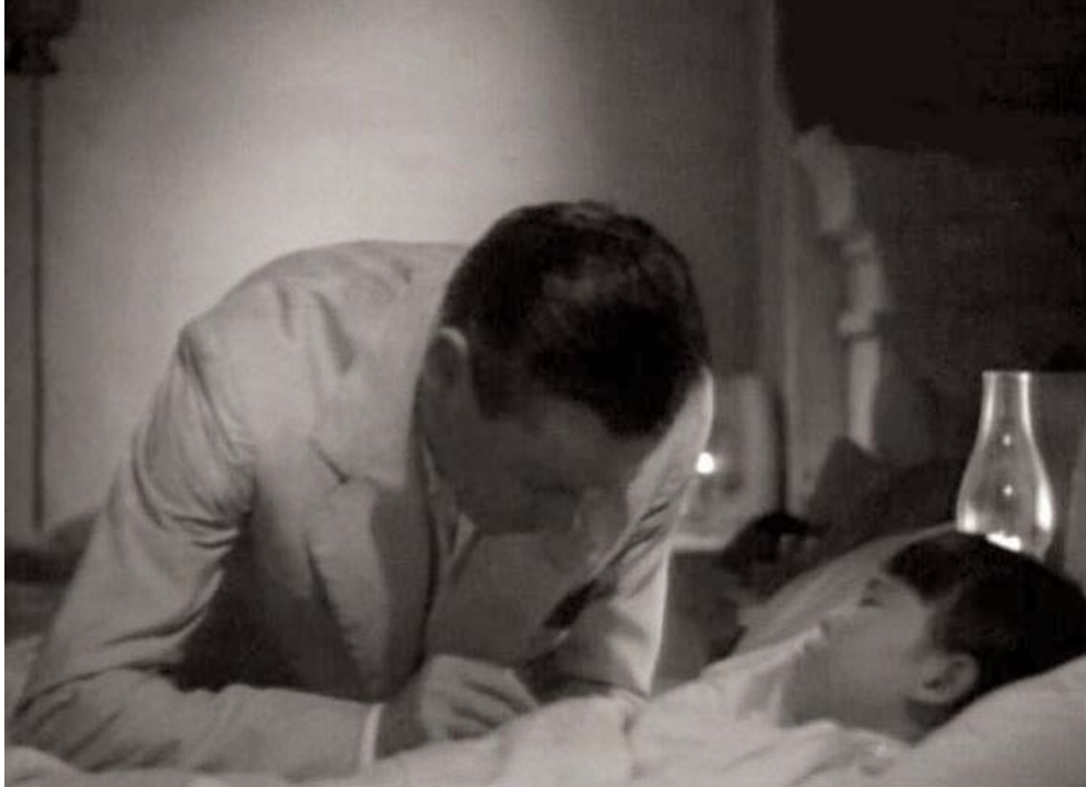
History of anti-cholera treatment: Injected caffeine