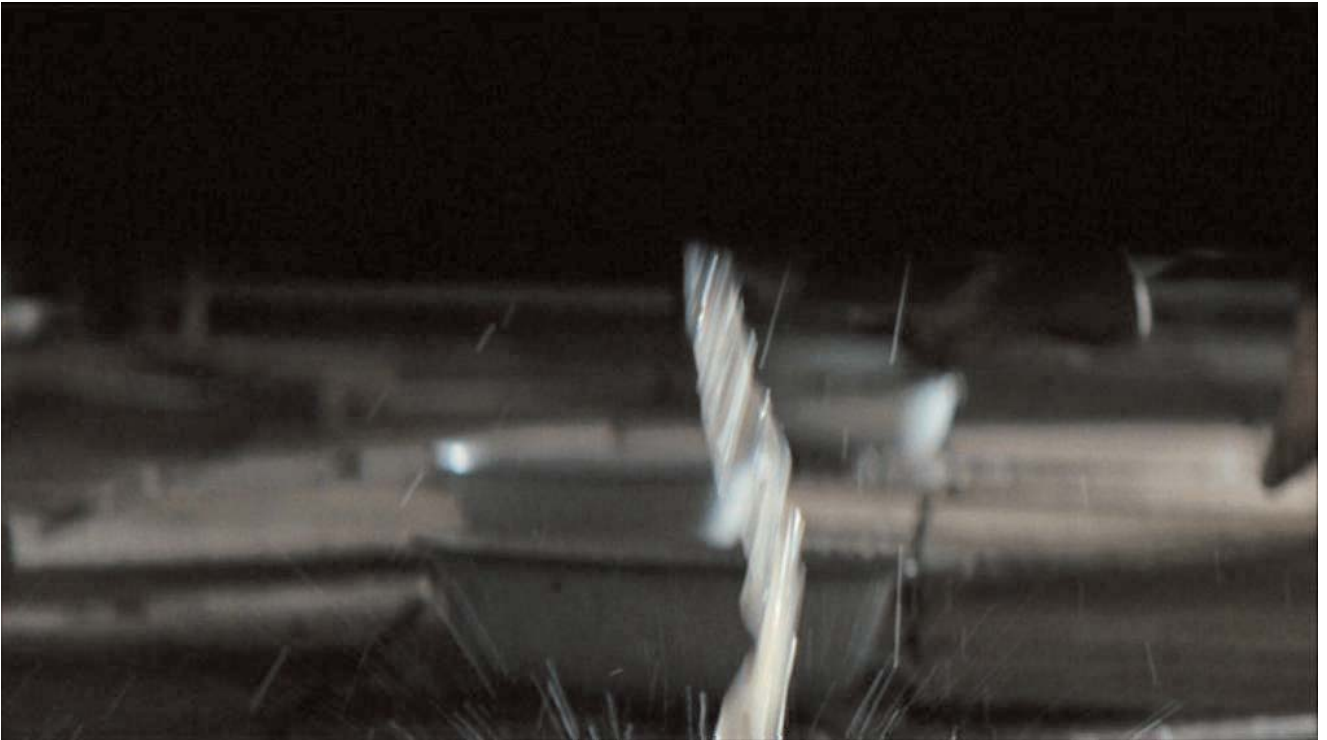
Clinical picture: Watery diarrhoea