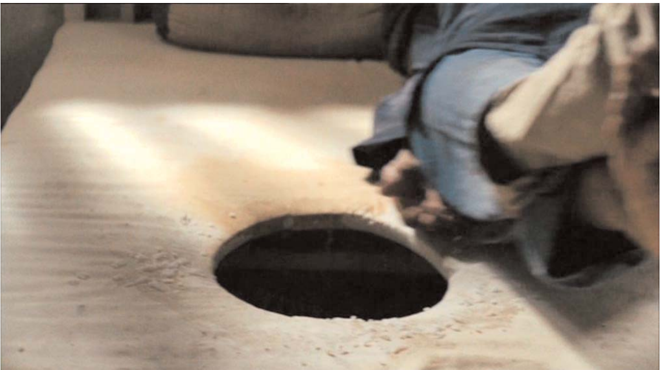
Clinical picture: Diarrhoea