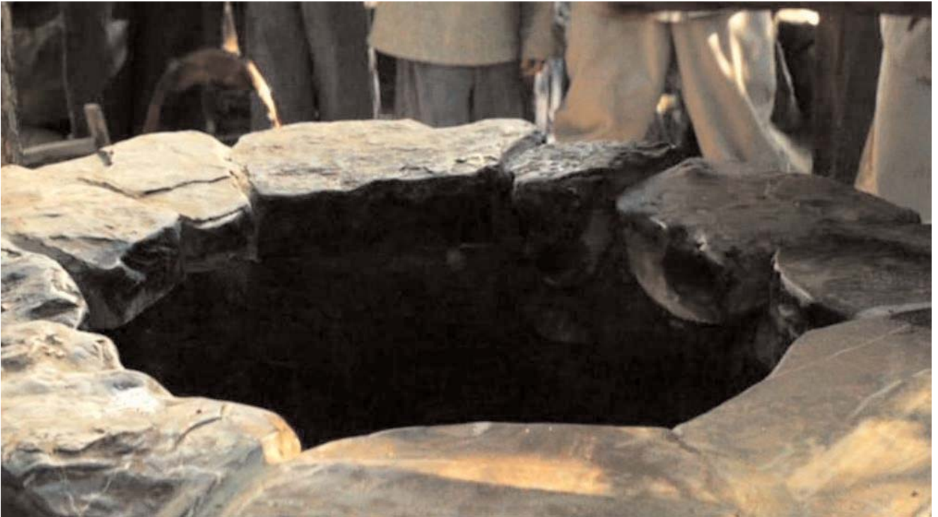
Epidemiology: Cholera is mainly transmitted through contaminated water