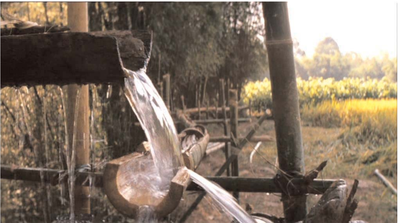
Prevention: Supply of clean water