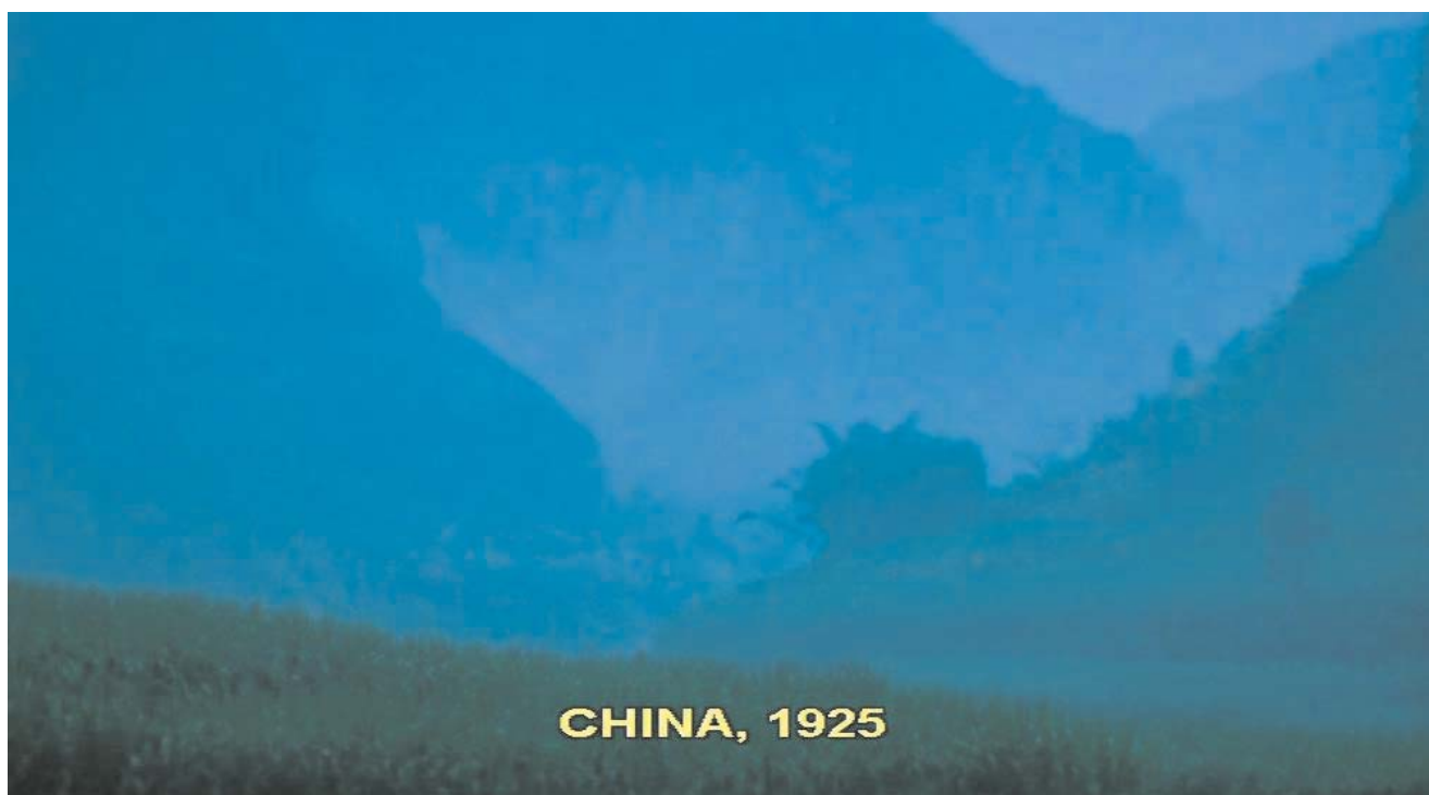
First cholera pandemic (1816-1826)

Production Companies: WIP, Stratus Film Co., Bob Yari Productions, Class 5 Films, The Colleton Company, Dragon Studios, Emotion Pictures, The Mark Gordon Company and Warner China Film HG Corporation.