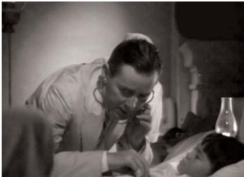
Clinical picture: Haemodynamic alterations

The action is set in China during the first quarter of the twentieth century. American poster USA poster