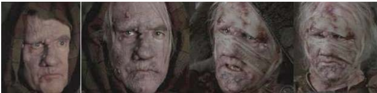
Figure 6: Evolution of the leprosy of Robert Bruce The Leper (Ian Bannen) in different scenes of the film

both for his leprosy, always such a mysterious and frightening disease, and for his skill for intrigue and machination.