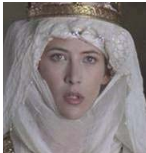
Figure 7: Isabella of France (Sophie Marceau)

The legend about a romantic relationship between William Wallace and a French princess perhaps came about in reference to Princess Margaret "The Pearl of France", who was the second wife of Edward I and does not appear as a character in the film.