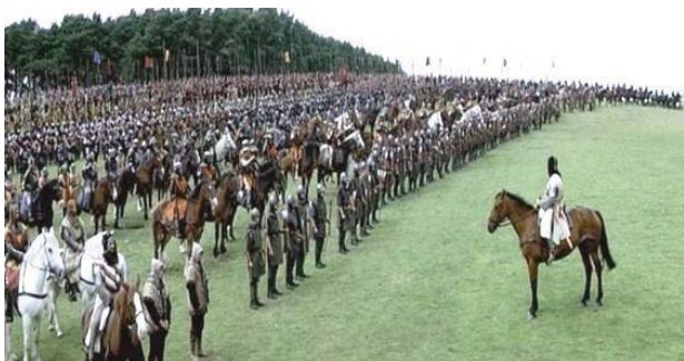
Figure 3: The Battle of Stirling. English Army

wish we were there with Wallace at Falkirk or with the Bruce in Bannockburn so that we could also give the invader what he deserved.