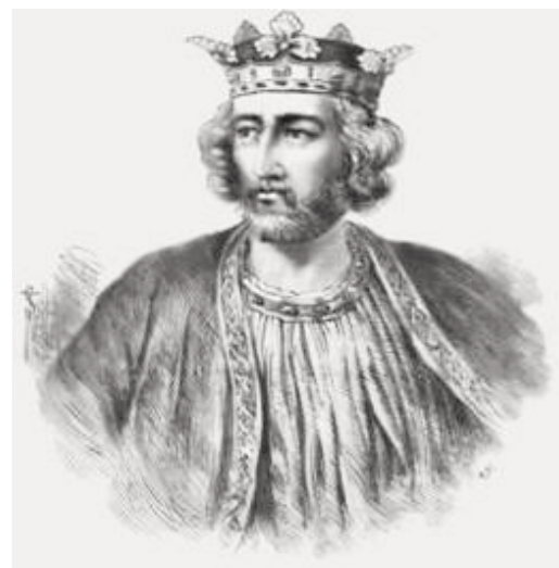
Figure 13: Edward I (Illustration taken from Cassell's History of England . Century Edition. Published circa 1902)

Thus, a long process began with almost fourteen Scots nobles claiming the throne, although soon only two claimants remained, John Balliol and Robert V the Bruce, grandfather of the young Robert who was to become King of Scotland. In this long process,