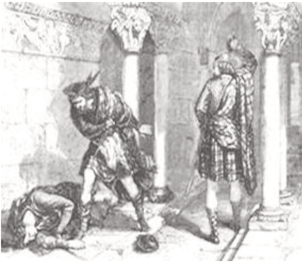
Figure 17: The death of Comyn

The fall of Stirling Castle was followed by the capture and execution of William Wallace in August, 1305. Shortly afterwards, Robert made a pact with Lamberton so that the latter could get him the support he needed to confront England. On 10 February, 1306, Bruce met with Comyn in a church in Dumfries, but Comyn refused to support his plans for rebellion against England. In the heat of the argument, Bruce took out a dagger and killed Comyn on the high altar (Figure 17).