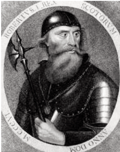
Figure 19: Robert I of Scotland