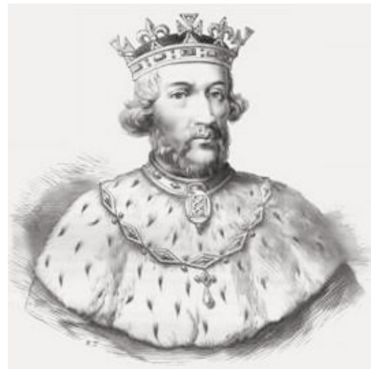
Figure 18: Edward II (Illustration taken from Cassell's History of England. Century Edition. Published circa 1902)

He died of leprosy in 1329. According to tradition, when he realized he was dying he told Sir James Douglas, his friend and lieutenant, of his wish that his heart be cut out and taken to the Holy Land to fight against the Mohammedans, in order to atone for his sins (he had been excommunicated for murdering John Comyn), since he believed that his disease was a punishment for them. James Douglas died in the Battle of Teba in Andalusia, in which he participated under the command of King Alphonse XI. He had gone there with the heart of Robert I. The heart was then returned to Scotland and buried in Melrose Abbey.