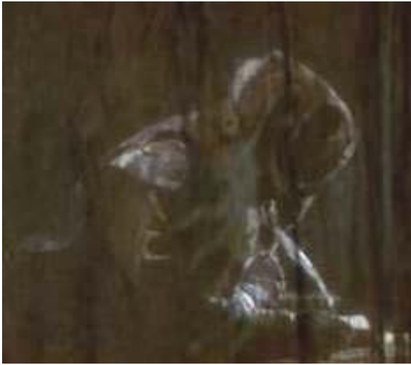
Figure 20: Isolation of Robert VI (Ian Bannen)

Leper colonies or lazarettos were created by the thousands in the Middle Ages, but were more a system of isolation and control than true hospitals. Entering one of these establishments was the same as being buried alive and was worse than roaming the roads and forests in spite of the prohibitions and of having to wear the distinctive clothing of a leper (Figure 20).