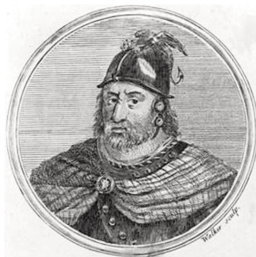
Figure 15: William Wallace (print from the end of the 17 th or 18 th century)

His early years took place in a peaceful, independent country that was relatively prosperous. At