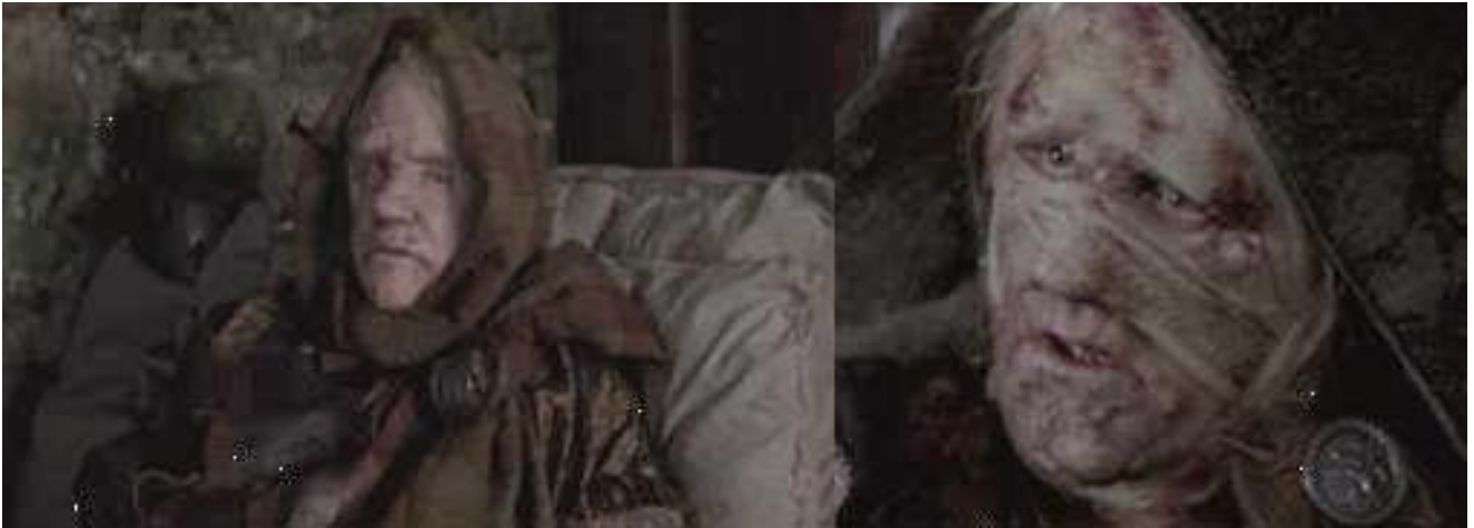
Figure 21: The clinical form of leprosy in the film seems to be lepromatous