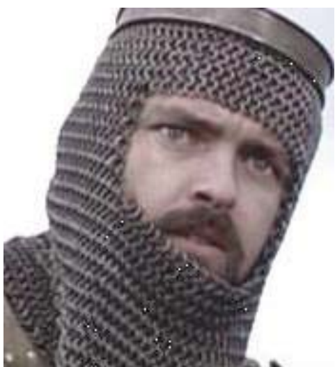
Figure 4: Robert I the Bruce (Angus Macfadyen)

Randall Wallace, who wrote the screenplay, confessed that he had read the poem about Wallace written by Blind Harry in 1470 (figure 5). It was writ-