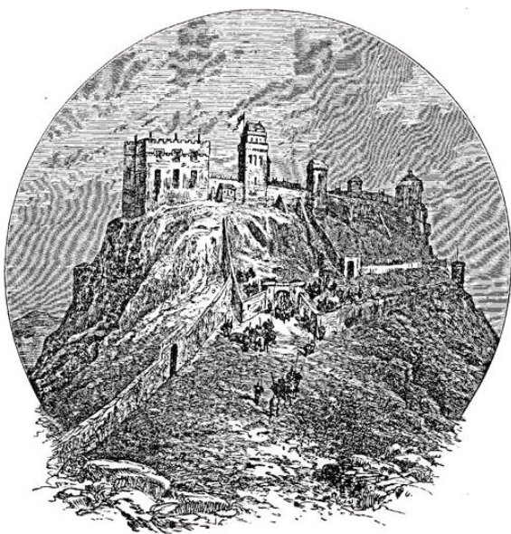
Figure 12: Edinburgh Castle before 1573 (Illustration taken from Grant J. Cassell's Old and New Edinburgh , Vol.1, Londres: Cassell & Co; 1880s)

He had been married to the sister of Edward I of England, with whom he had three sons, all of