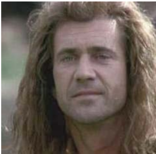
Figure 1: William Wallace (Mel Gibson)

William Wallace returns to his village (Figure 1) some years later for a wedding celebration, but the fun is cut short by the appearance of English soldiers who come to take the bride to spend a night with their Lord, who claims his right to jus primae noctis that the king of England, Edward I (Patrick McGoohan), has reinstated.