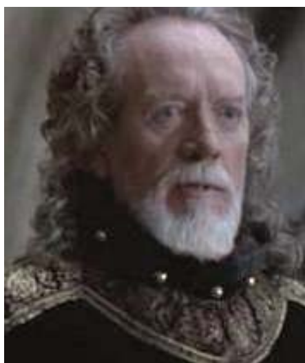
Figure 9: Edward I (Patrick McGoochan)

According to some English chroniclers, Edward I (Figure 9) was a great king. He set up a parliamentary system, conquered Wales and Ireland, and also loved his wife deeply. But the atrocities that appear in the film do not seem to have been exaggerated, since, for example, the executions of Robert I's three brothers actually took place, as did the execution and quartering of Wallace, all of which suggests