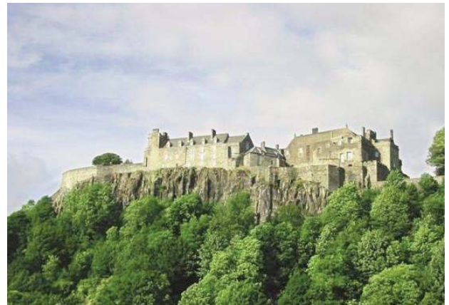
Figure 16: Stirling Castle

The Scots nobles, with King John imprisoned in London, carried on with their disputes over the succession to the throne and did not give Wallace support. Wallace defeated the English several times but had to return to Scotland because Edward I, who had just returned from France, was going to attack him. In June, 1298, the English king moved to the north with 25,000 men on foot and more than 2,000 on horseback and on 21 June defeated Wallace at