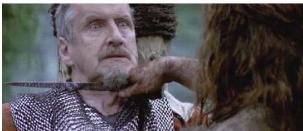
Figure 8: Wallace kills the man who executed Murrin

friend out the window. Although it is never stated in the film, this friend may have been Piers Gaveston, who, although exiled by Edward I, survived him to become the favourite of King Edward II during the first years of his reign.