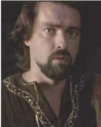
Figure 11: Robert I (Angus Macfadyen)

In 1286, King Alexander III reigned in Scotland and the country was experiencing one of the most prosperous moments in its history thanks to the wool trade with Europe. It was also an independent nation that lived in peace with neighbouring England.