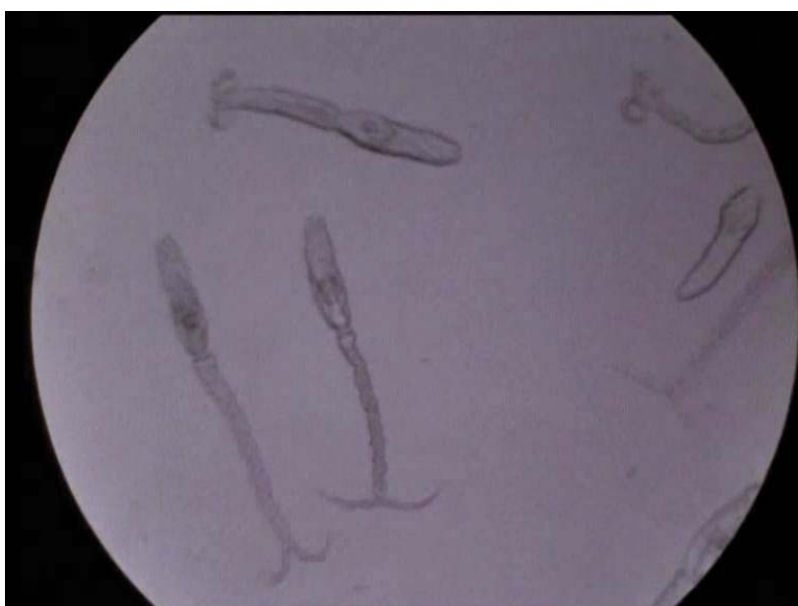
...cercariae of Schistosoma japonicum in water