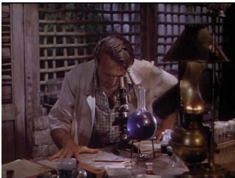
Visualization under the microscope to demonstrate....