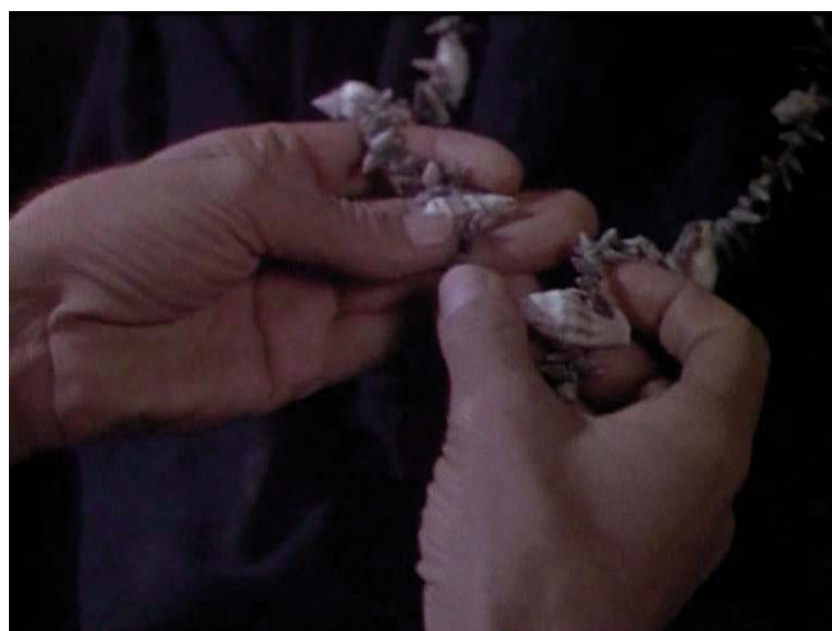
Some species of snails are the intermediate hosts of Schistosoma japonicum