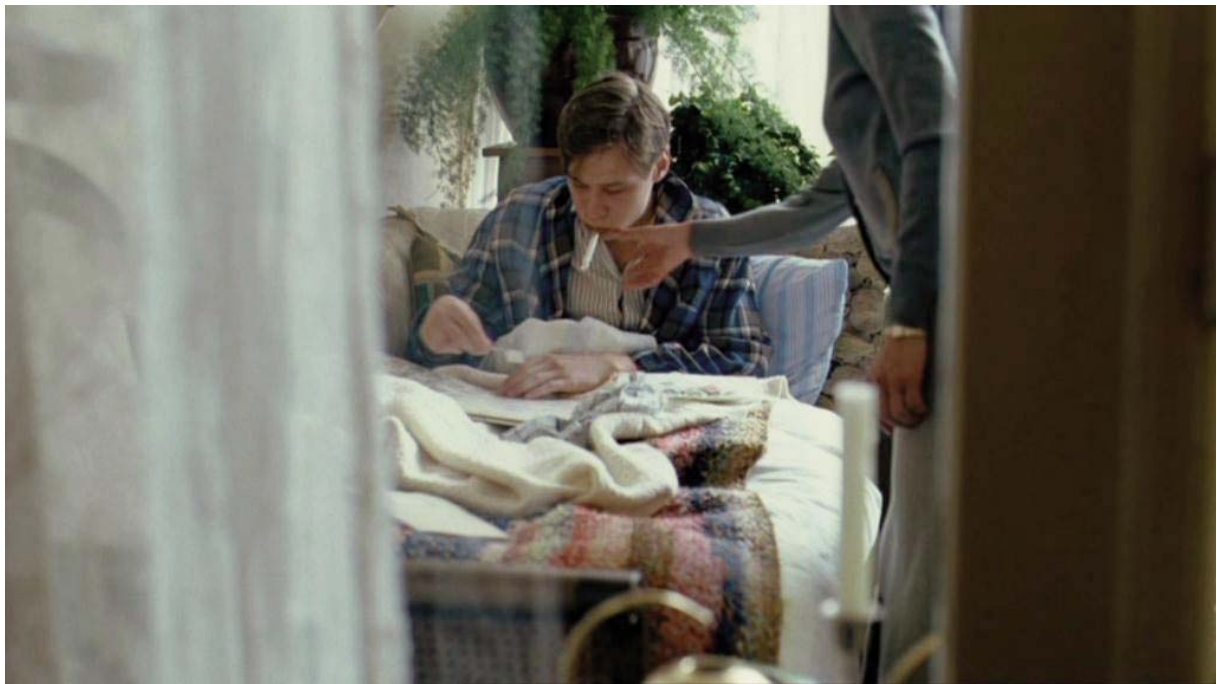
Fever and bed rest.