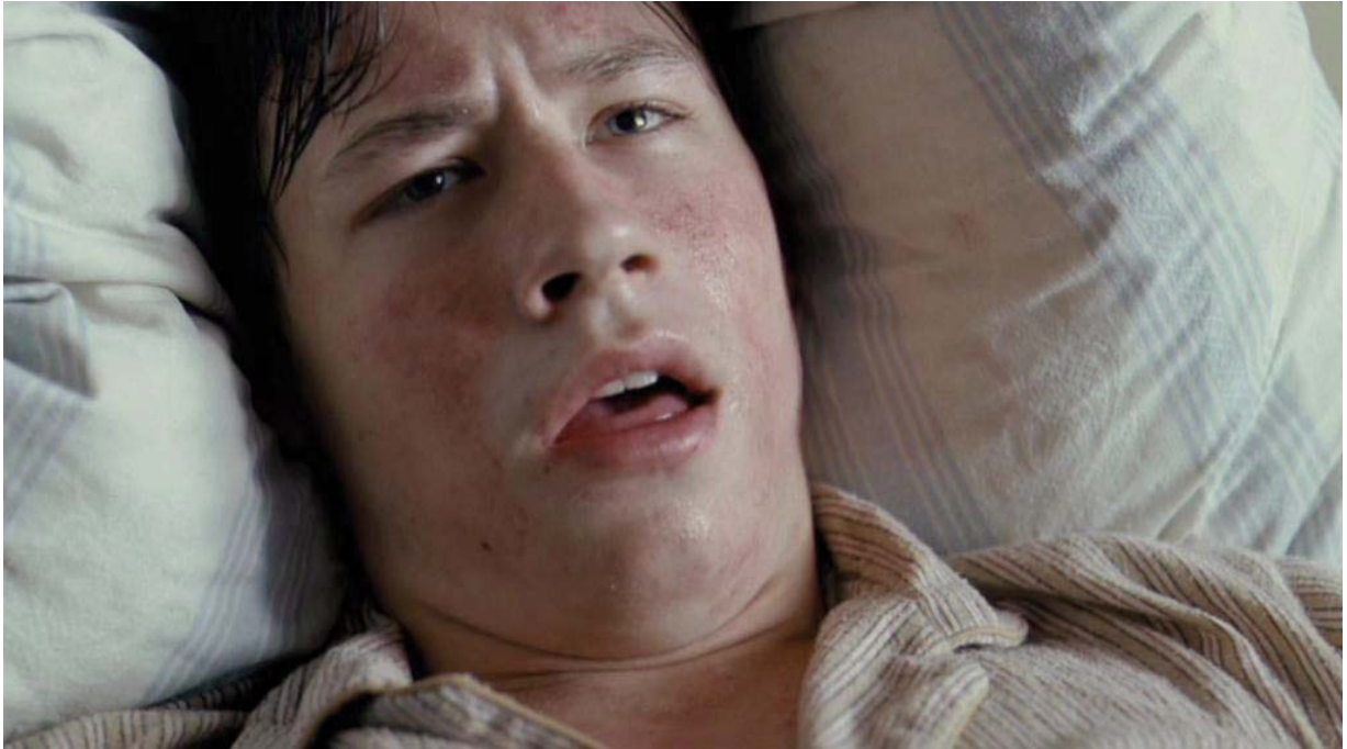
Flushed face with perioral pallor is observed.