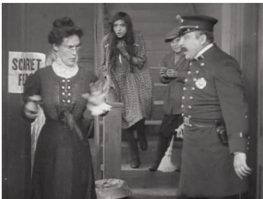
Some children in the building put a notice on the door to the apartment that reads "Scarlet Fever", leading the police to quarantine the people in the apartment.

http://www.youtube.com/watch?v=MNIB6sPRGx0