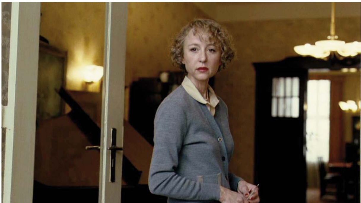
Home respiratory isolation for scarlet fever.