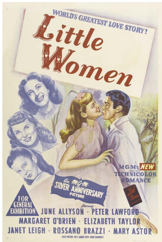
Action: between 1861 and 1865 (New England, USA). American poster.