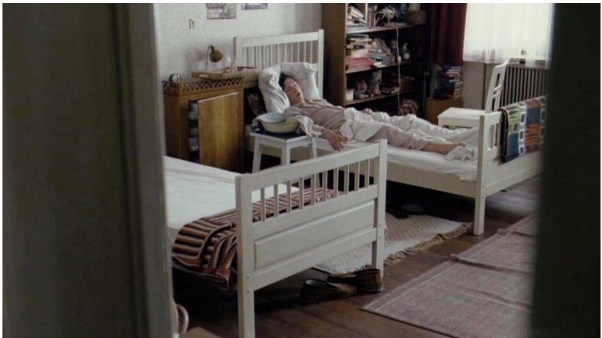
Prostration in bed.