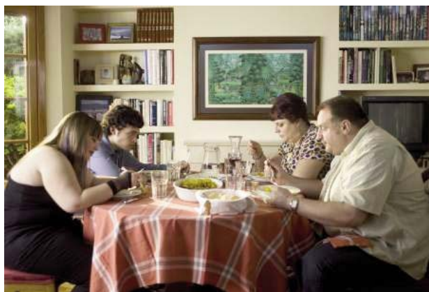
Figure 6: The obese family having lunch.

with him (he gives spoonfuls of cake to his wife), in an act full of apparent affection. However, he confesses that he does this to minimize the guilt he feels about his enormous appetite (Figure 6).