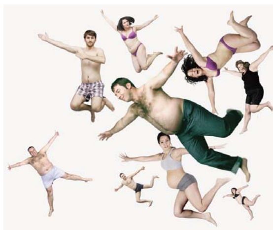
Figure 1: The main character of Gordos .

Although there is a discrepancy in the psychological determinants of obesity, all health professionals agree that overweight and obesity increase general morbidity and mortality. Obesity is a risk factor for some car-