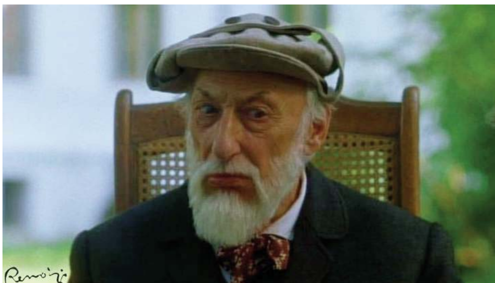
Auguste Renoir (1841-1919)...