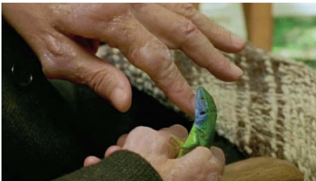
Deformity and ankylosis of the joints