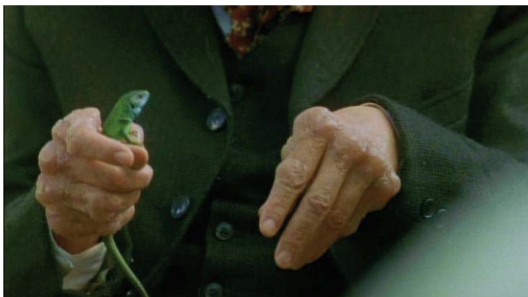
Primarily affects proximal interphalangeal and metacarpophalangeal joints