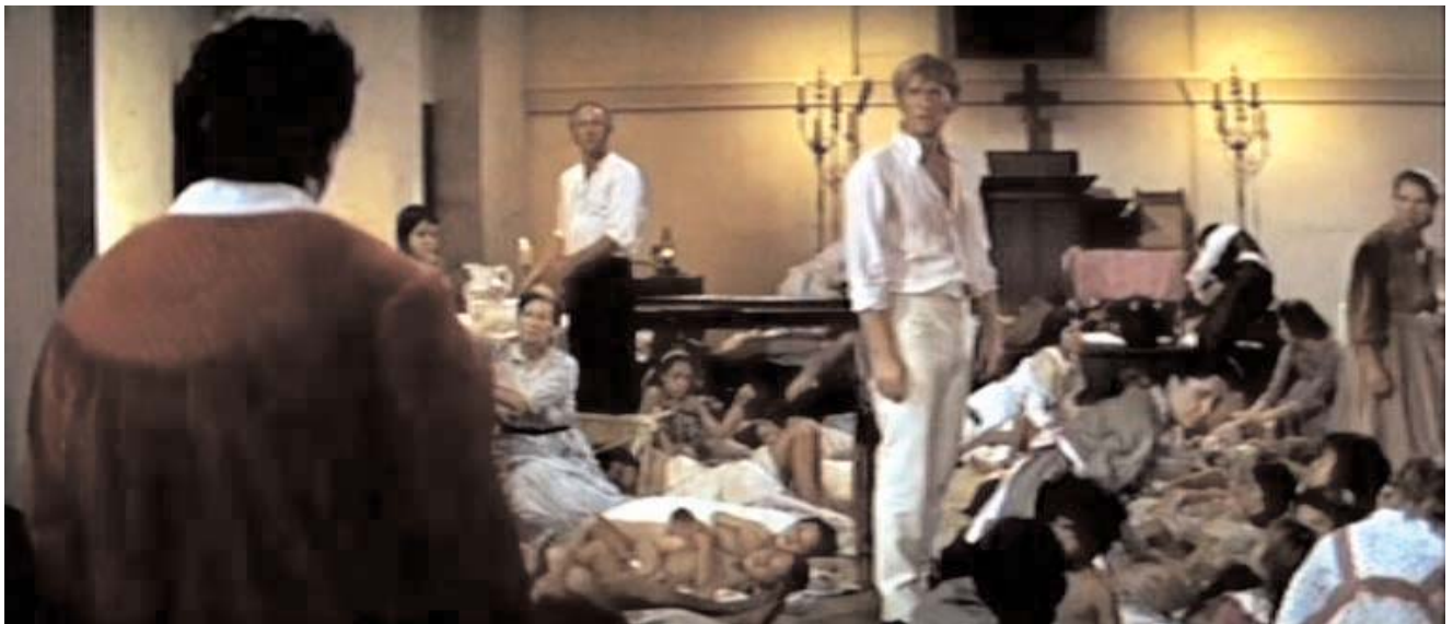
Imported disease. Outbreak of measles in the indigenous population

The film takes place in Hawaii during the nineteenth century USA poster