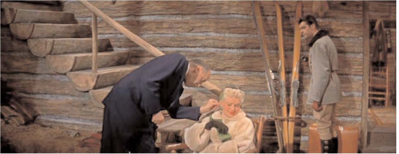
Retroauricular exanthem (site of onset). Loco Dempsey (Betty Grable) says his eyes are watering