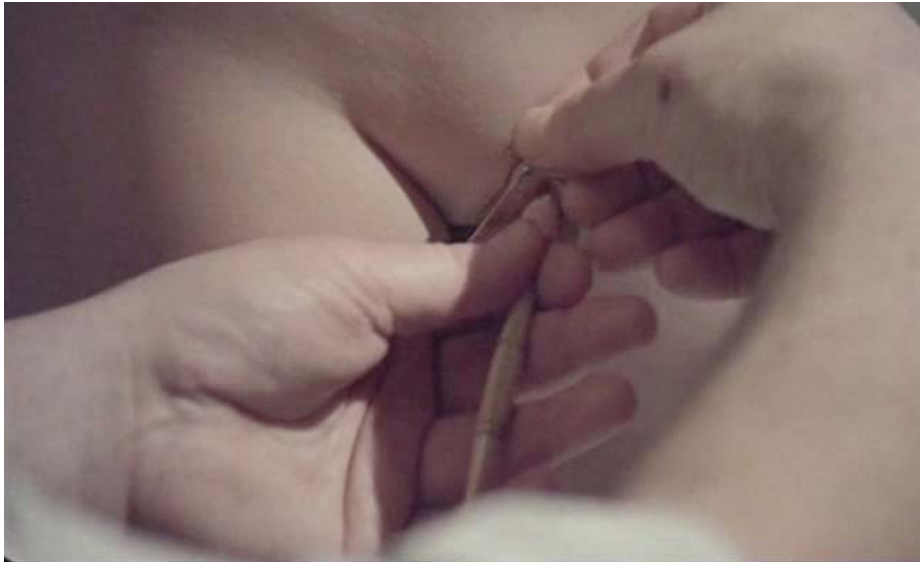
Placement of a forceps so that skin along its outside edge can be cut.