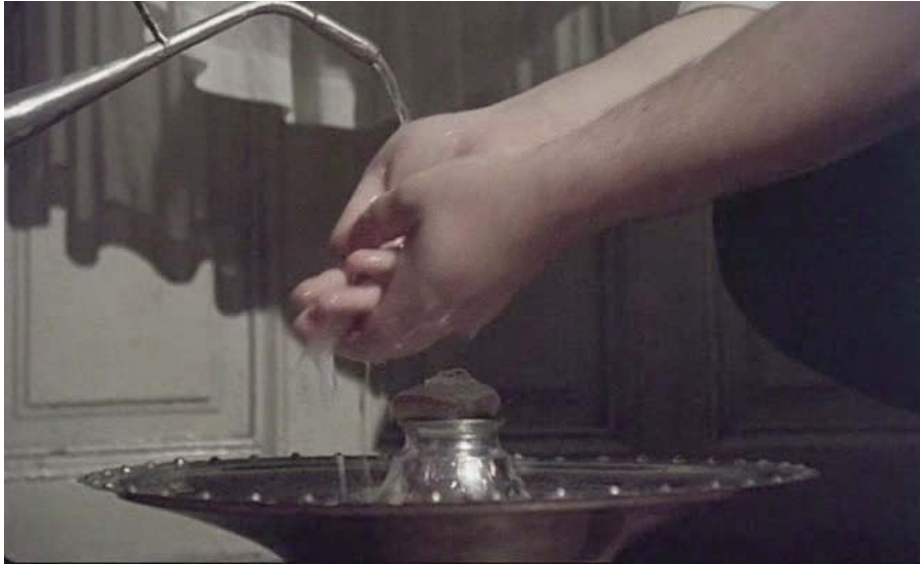
Hand-washing before the procedure.