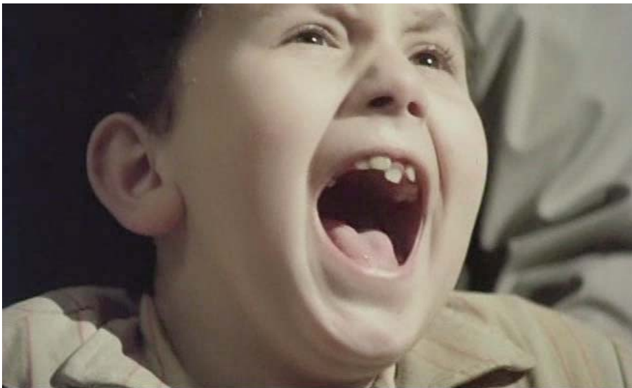
Painful grimace on boy's face considering no local anesthesia was used.