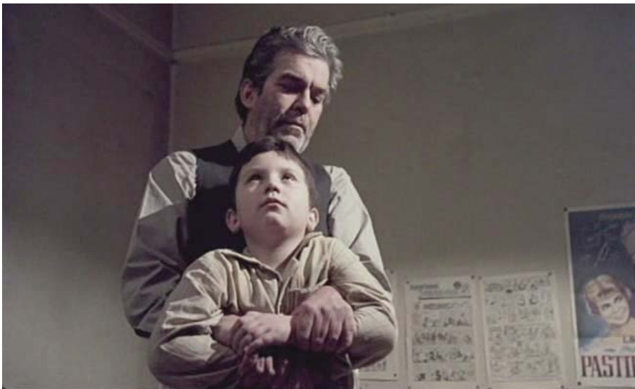
The boy is held tightly to prevent any sudden movements.