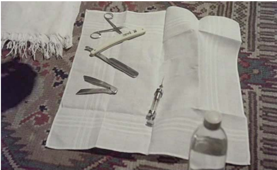
Circumcision set on the floor.