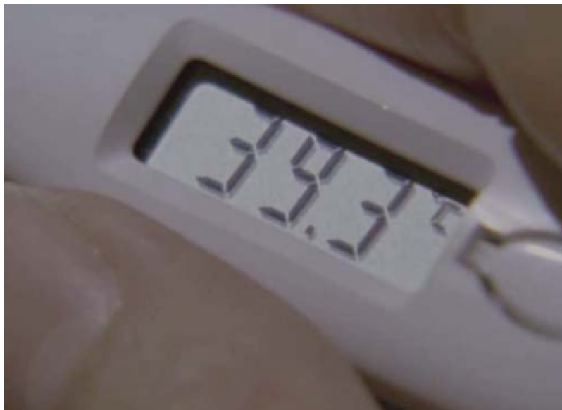
Symptoms: High fever.