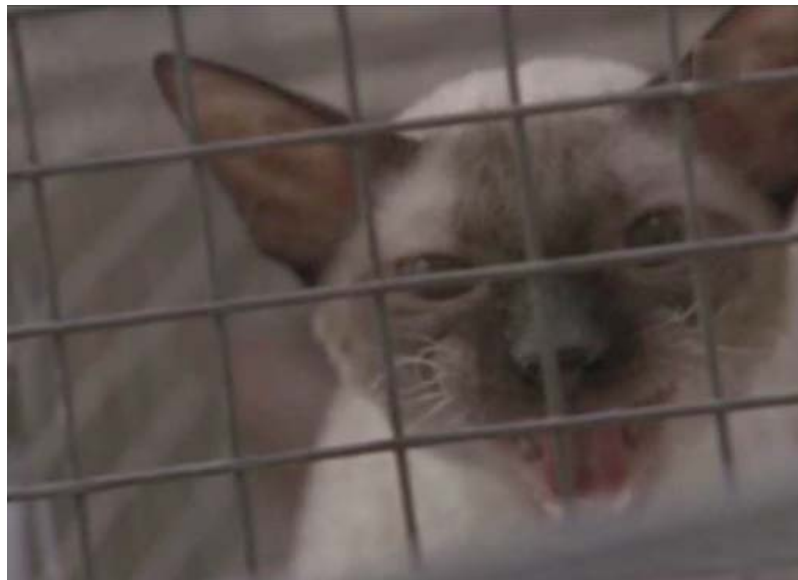
Epidemiology: Reservoir in nature: Chinese small mammals (civet cat).