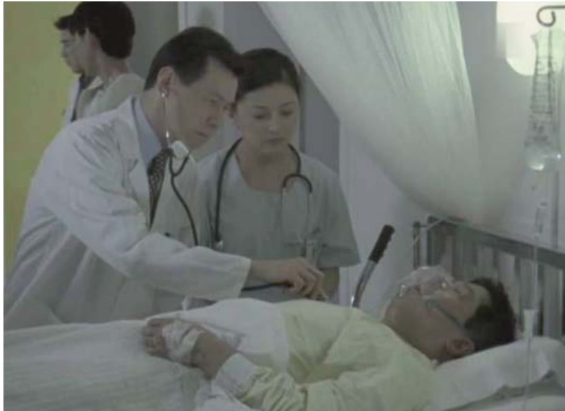
Symptoms: Respiratory distress.