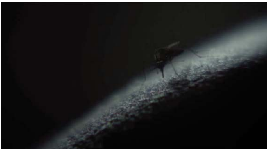
Vector: Anopheles spp.