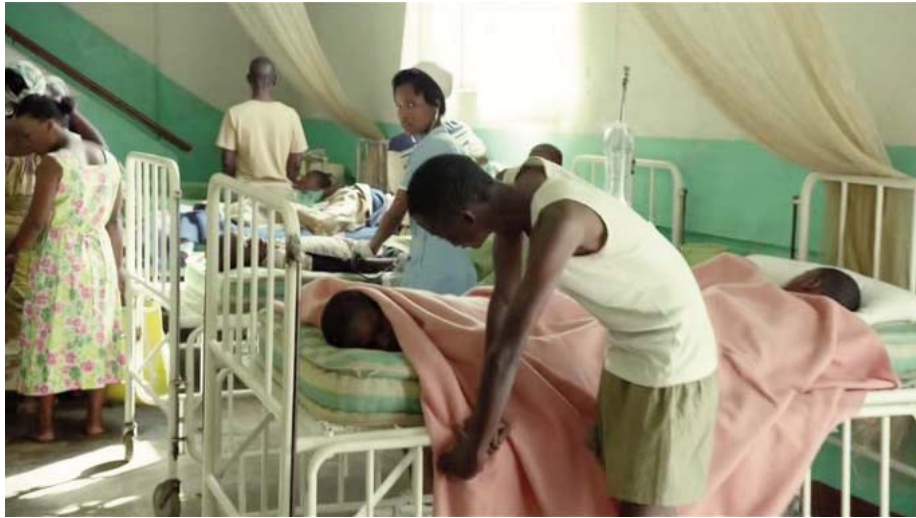
Lack of sanitary resources.