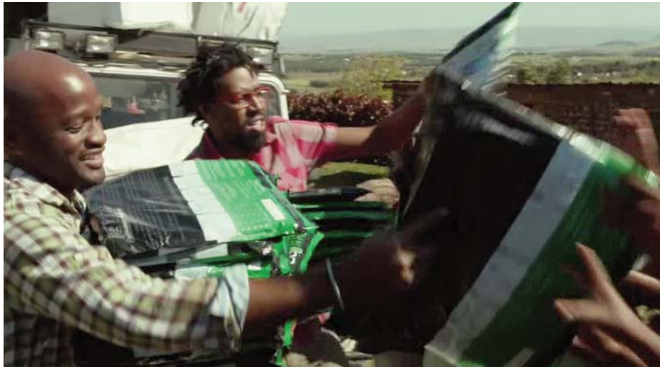
An effective and economical prevention measure: mosquito nets distribution.