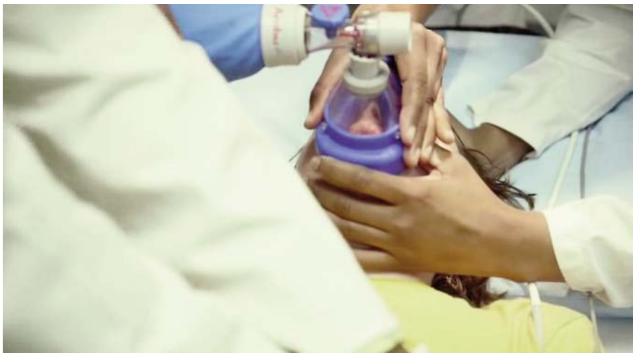
Cardiopulmonary resuscitation (CPR).