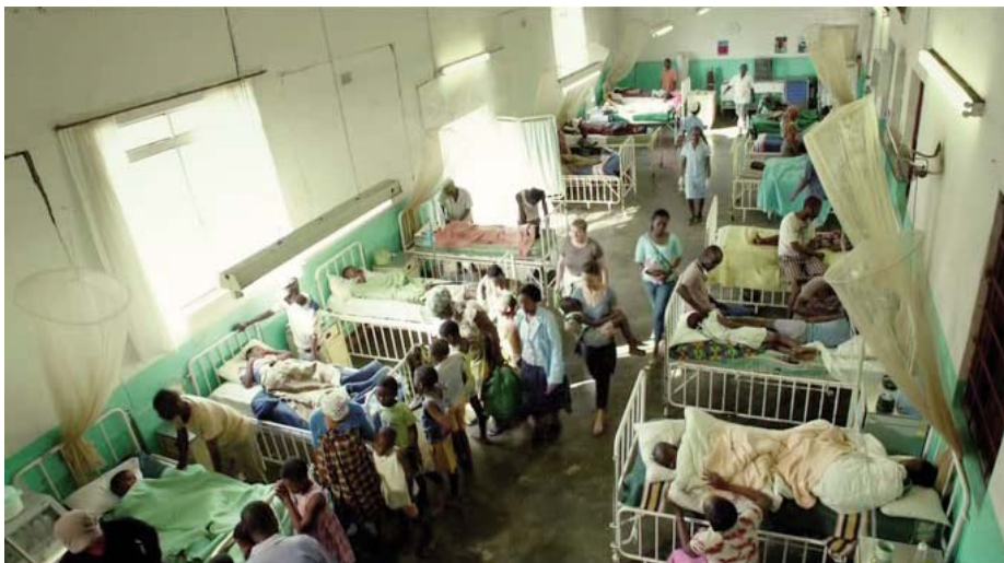
Malaria endemicity in Mozambique.