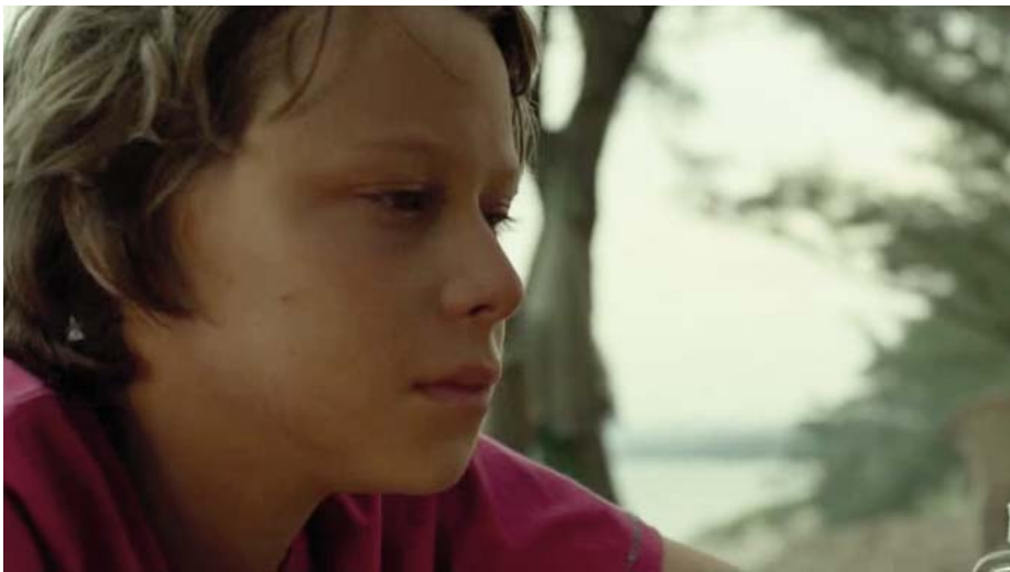
Bad general condition.