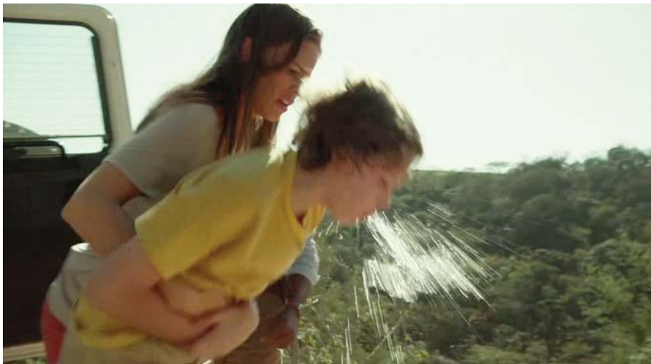
Vomiting ( Plasmodium falciparum ).