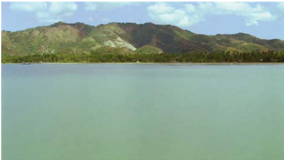
Mozambique, area of Plasmodium falciparum distribution.