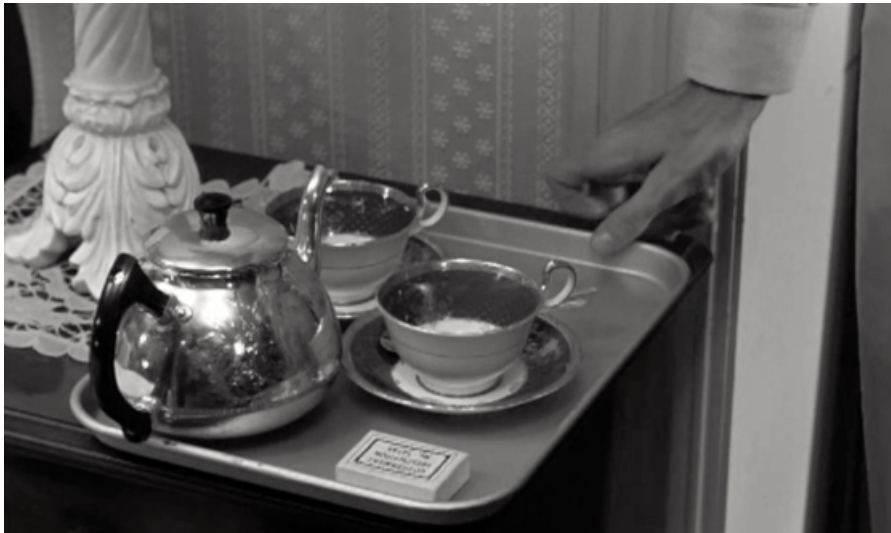
Ingestion of sleeping pills with tea from a family with her baby.