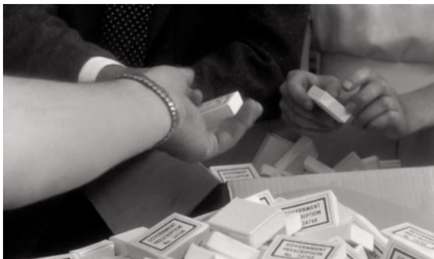
Delivery of sleeping pills as members of each family.