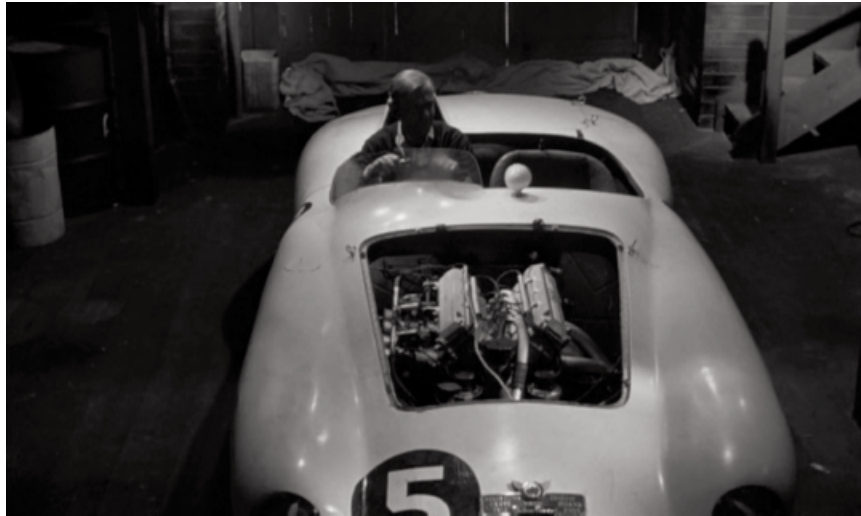
Prefers suicide by inhaling exhaust fumes from your car locked in your garage.