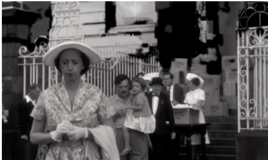
People queuing to collect the box of sleeping pills.