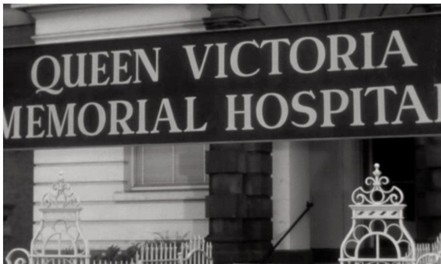
Hospital responsible for the delivery of sleeping pills the entire population.