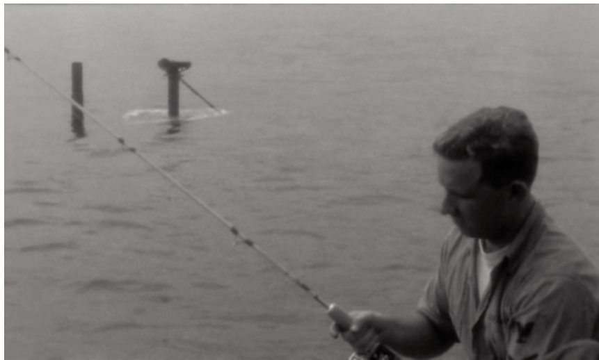
A marine crew outdoors fishing in the Bay of San Francisco, unprotected and totally contaminated with the radioactive cloud.