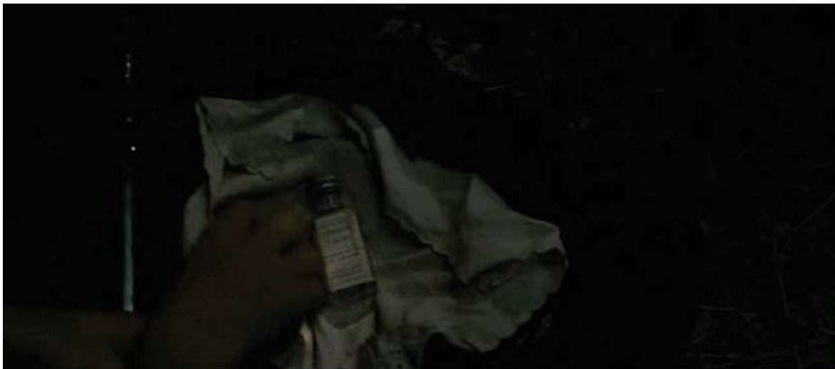
Quinine was the main treatment, often bought on the black market.