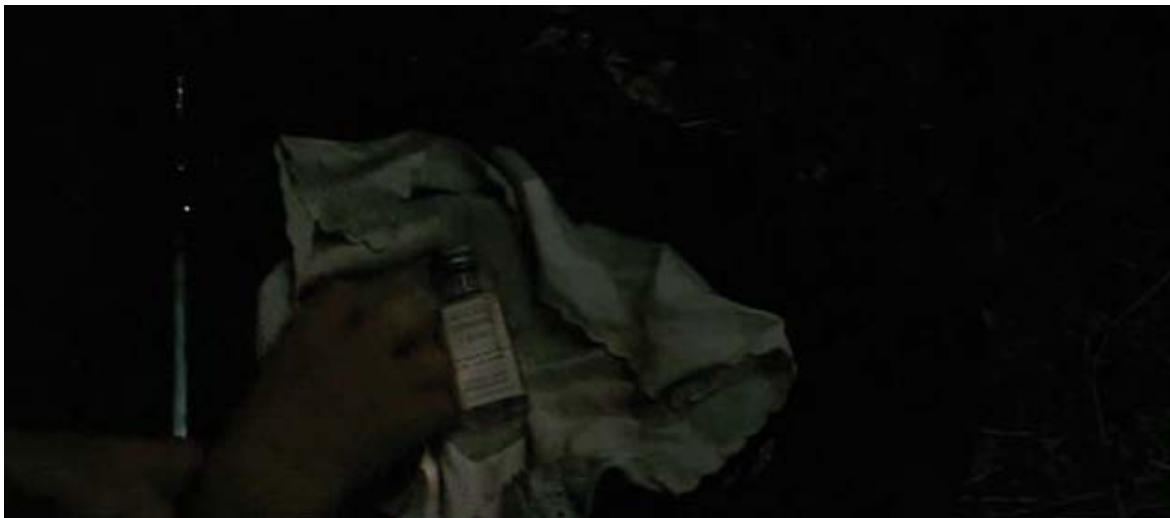
Quinine was the main treatment, often bought on the black market.