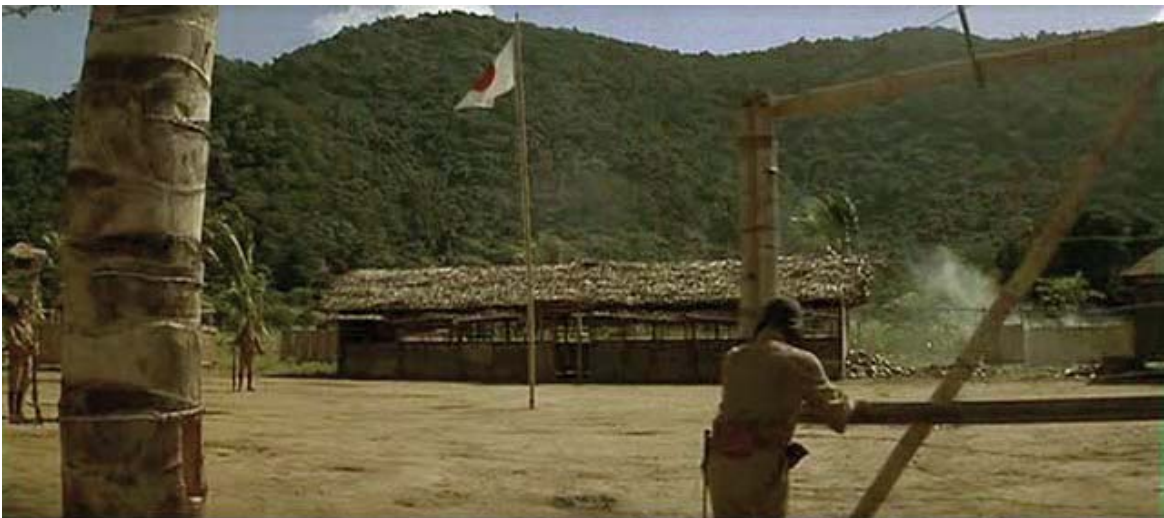
Malaria was a problem during the Second World War in Asia, affecting not only combatants but also prisoners in the concentration camps, like Japanese in Sumatra.