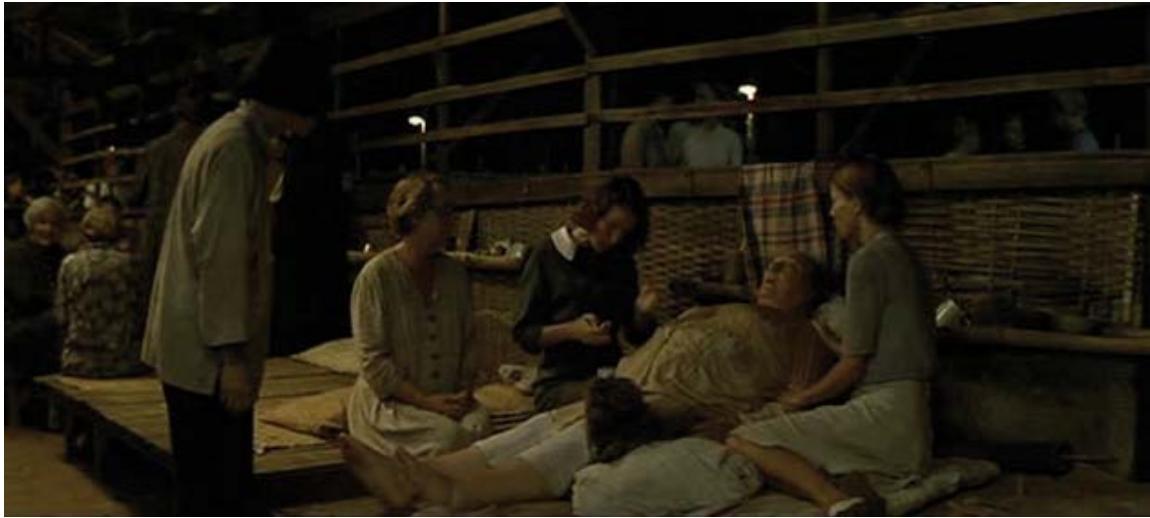
Bad general condition.