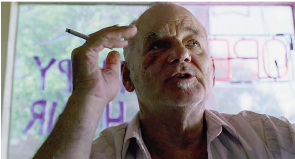
An elderly, smoker male...