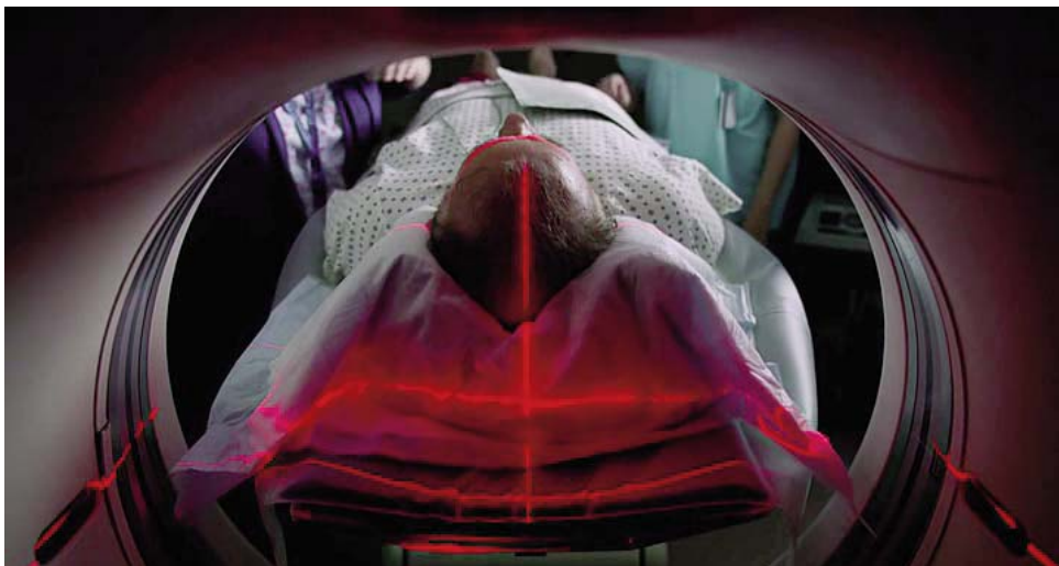
...because of which he is taken to the hospital, where he is done a brain CT...