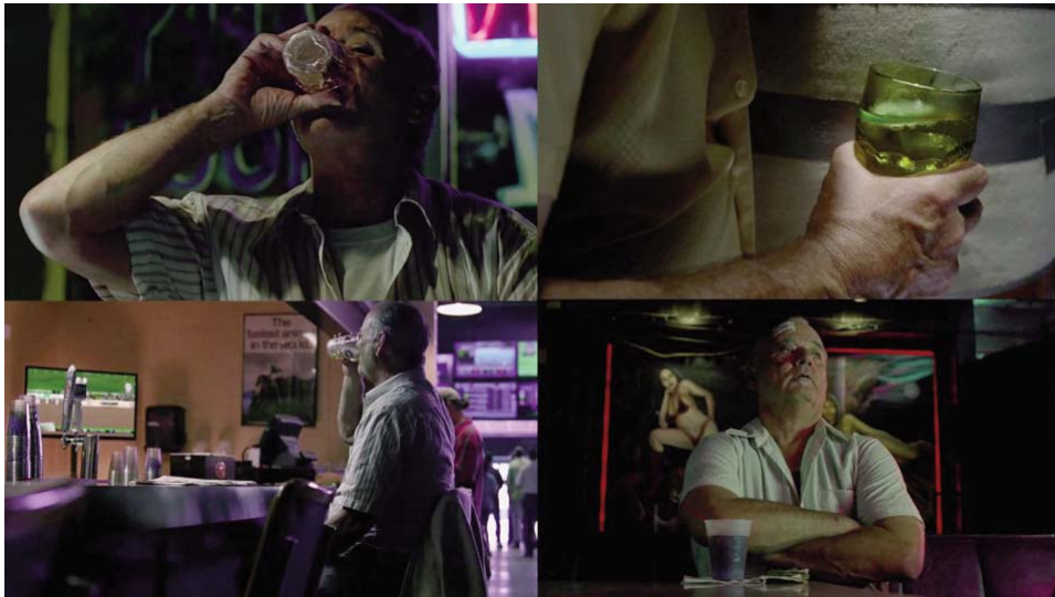
...who drinks a lot of alcohol...