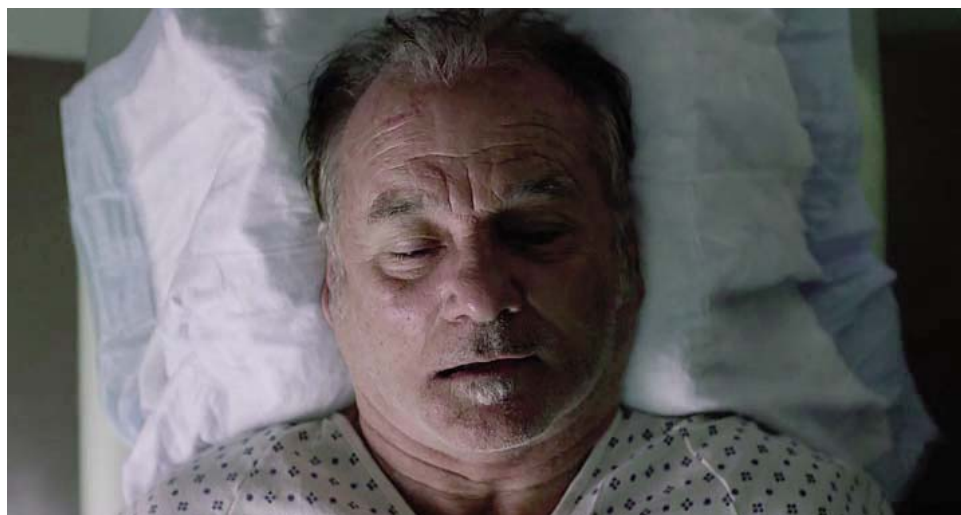
Apparently, he has suffered a stroke and has symptoms as...