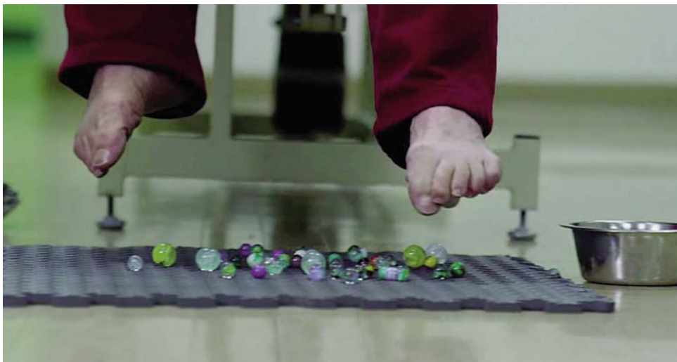
...and coordination therapy.