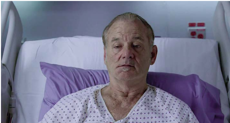
...deviation of the right labial commissure,...