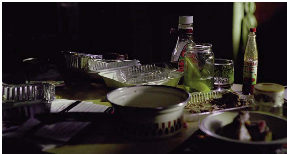
...and has a poorly balanced and high in cholesterol diet,...