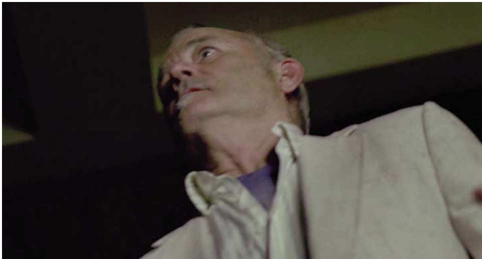
...suddenly suffers a loss of consciousness...