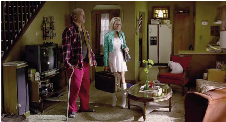
He is discharged with a contralateral, residual right-sided hemiparesis, for which...