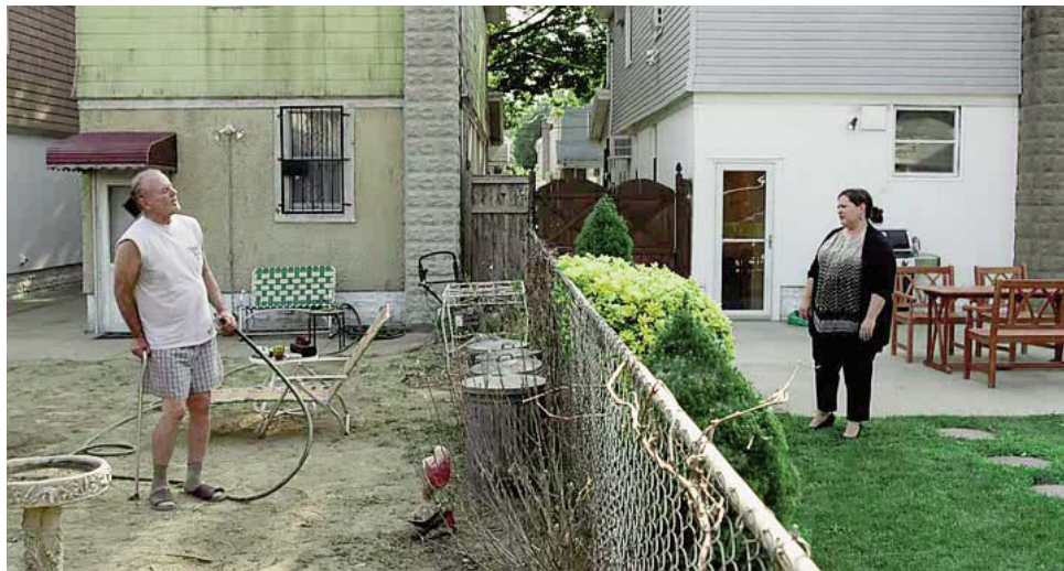
...he needs the support of a walking stick.