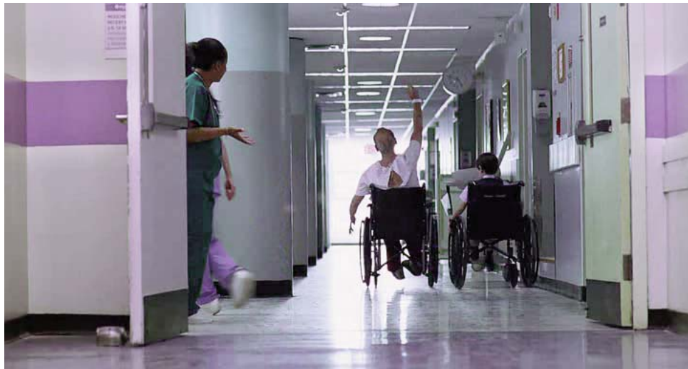
...loss of legs' strenght...