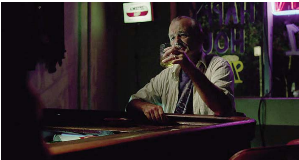
...with a messy and sedentary life...