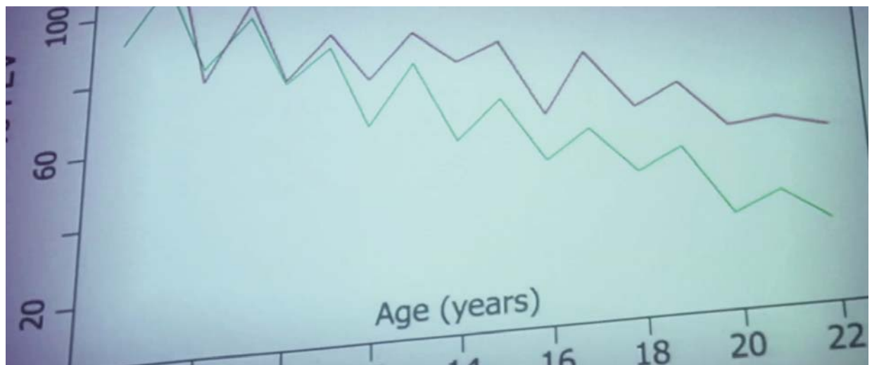
... progressively deteriorating their function.