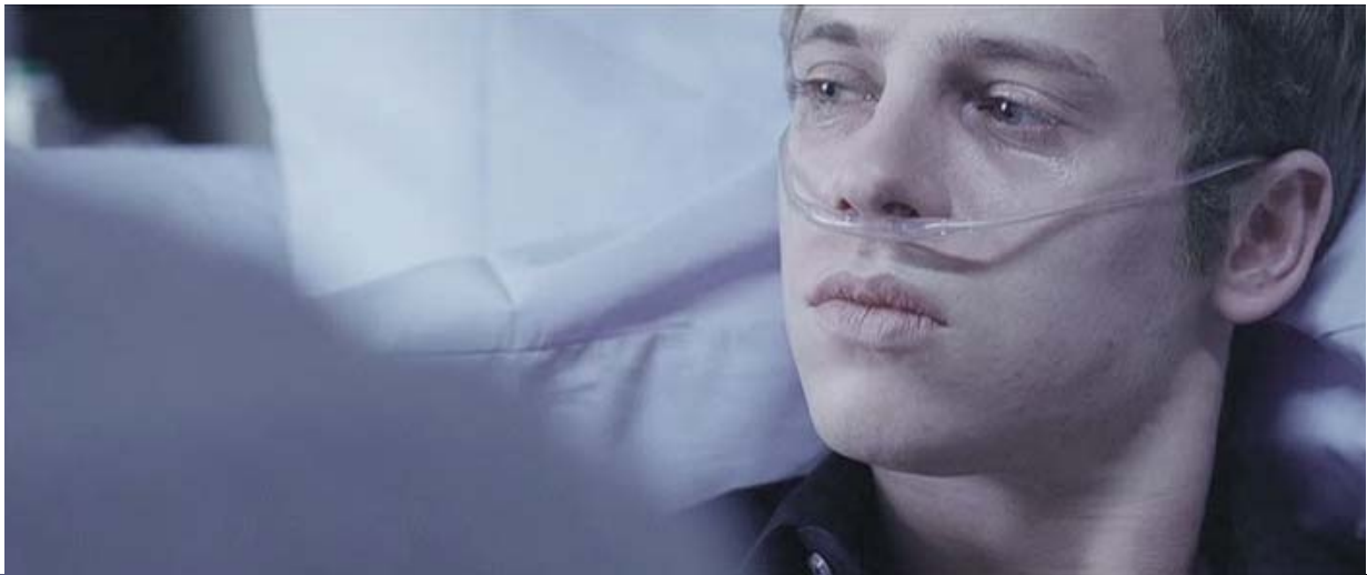
... oxygen therapy and...