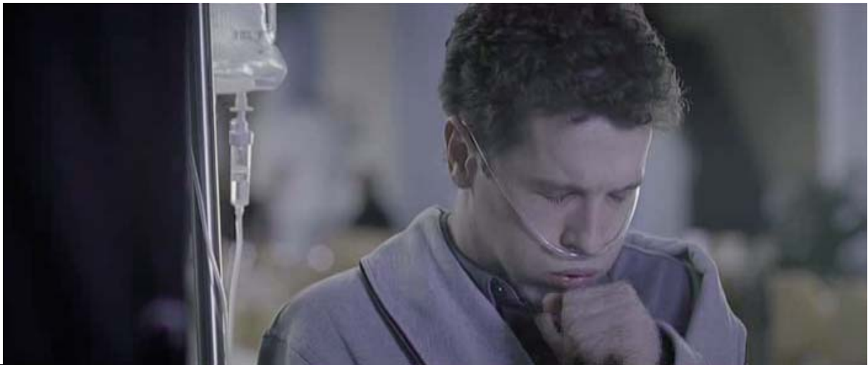
In addition to infections, cough...