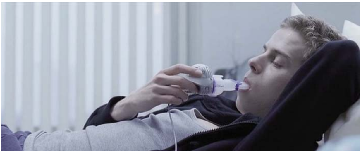
Therapeutic measures include aerosol therapy...