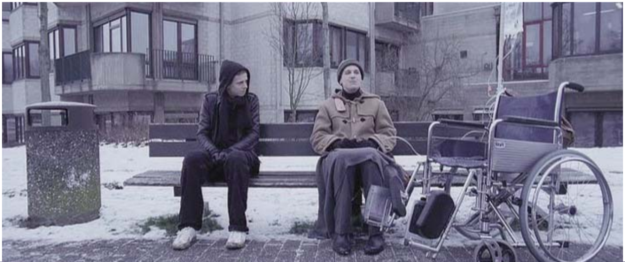
... and fatigue can be found among the clinical manifestations.