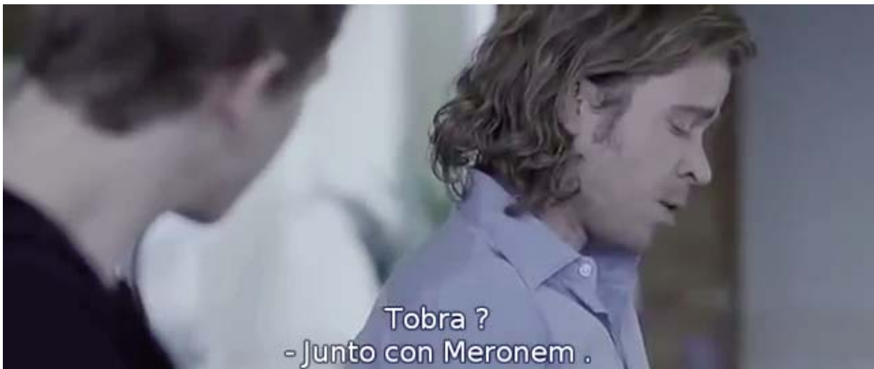
... use of antimicrobials agents...