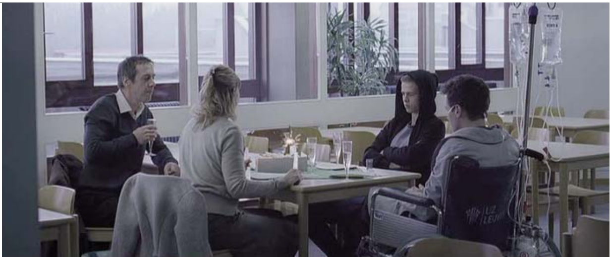
It is an autosomal recessive hereditary disease (in the movie, two brothers suffer it but not their parents)...