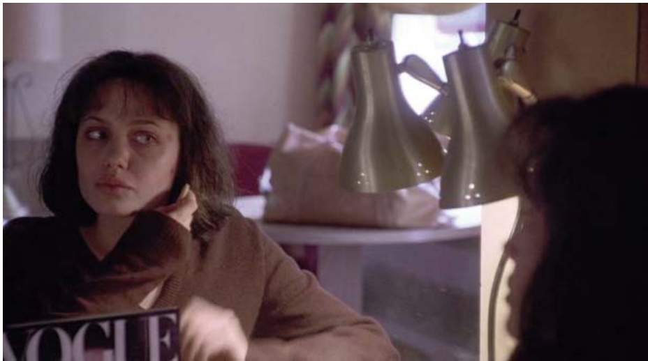
Facial Kaposi's sarcoma.