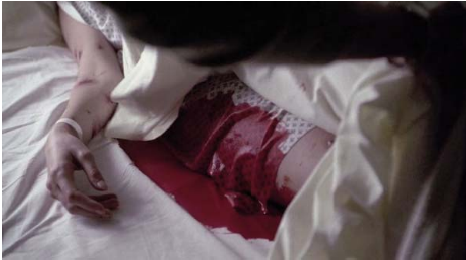
¿Gastrointestinal? ¿Genital? Haemorrhages