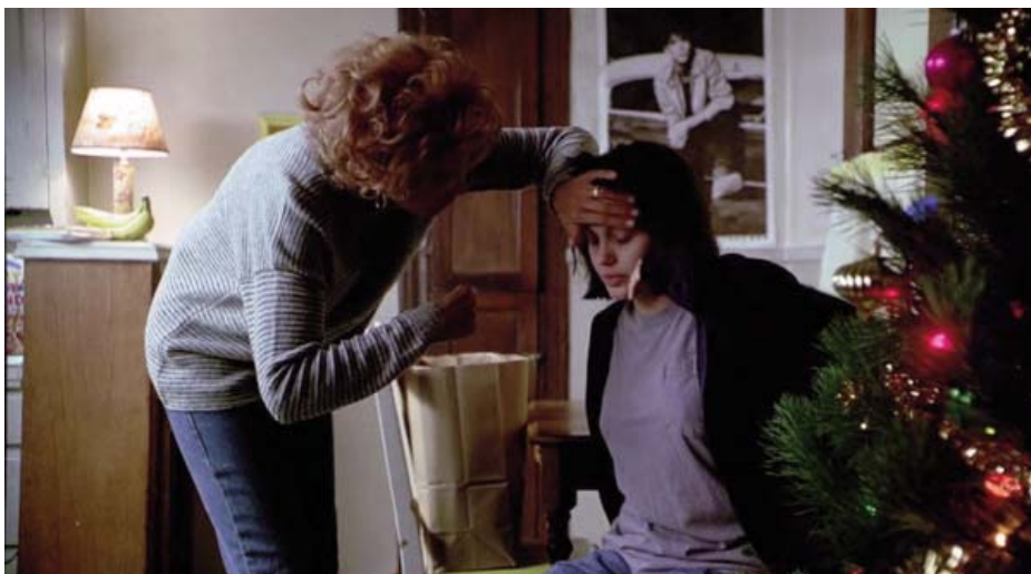
The AIDS begins. Fever...