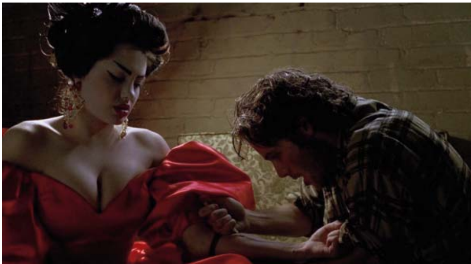
First hit (shared use of needles in parenteral drug users).