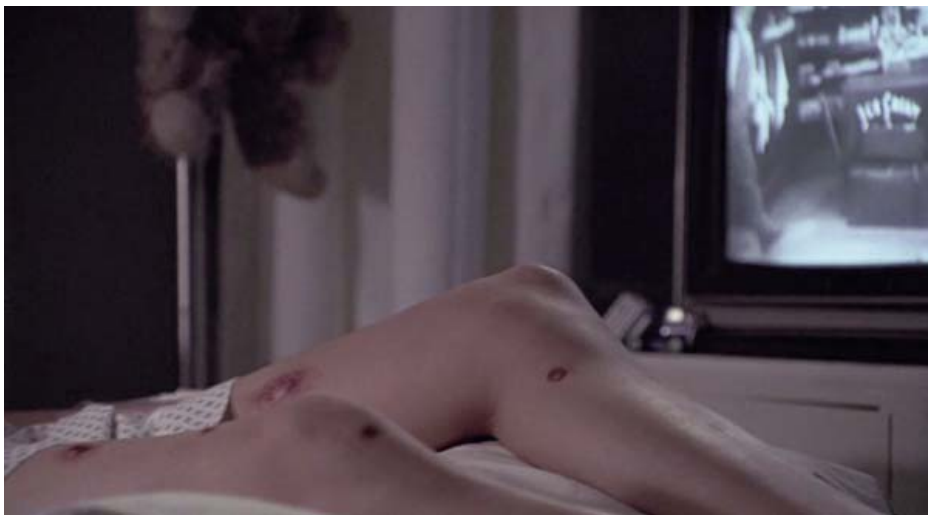
The disease progresses. Numerous Kaposi's sarcoma injuries on the legs...