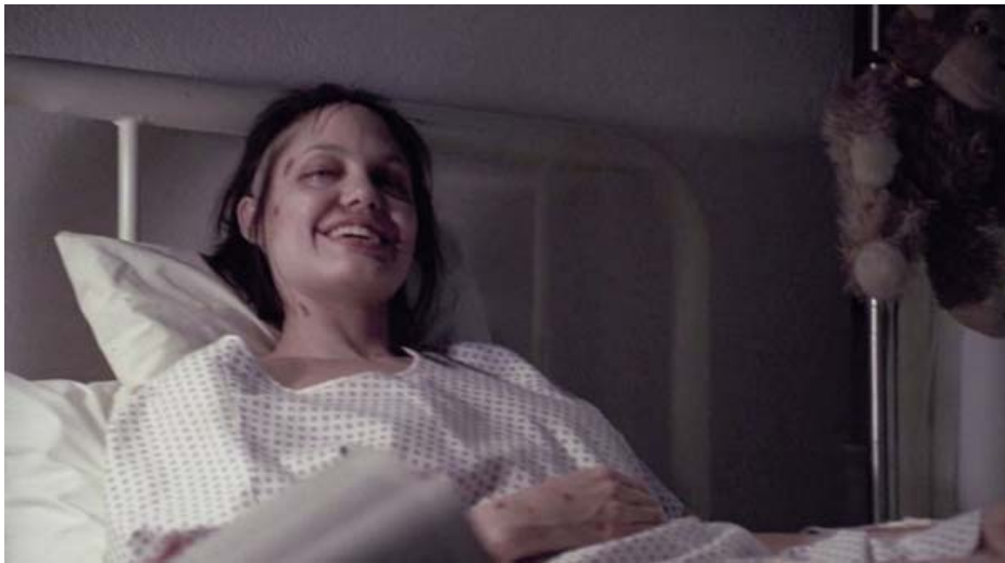
... and the face.