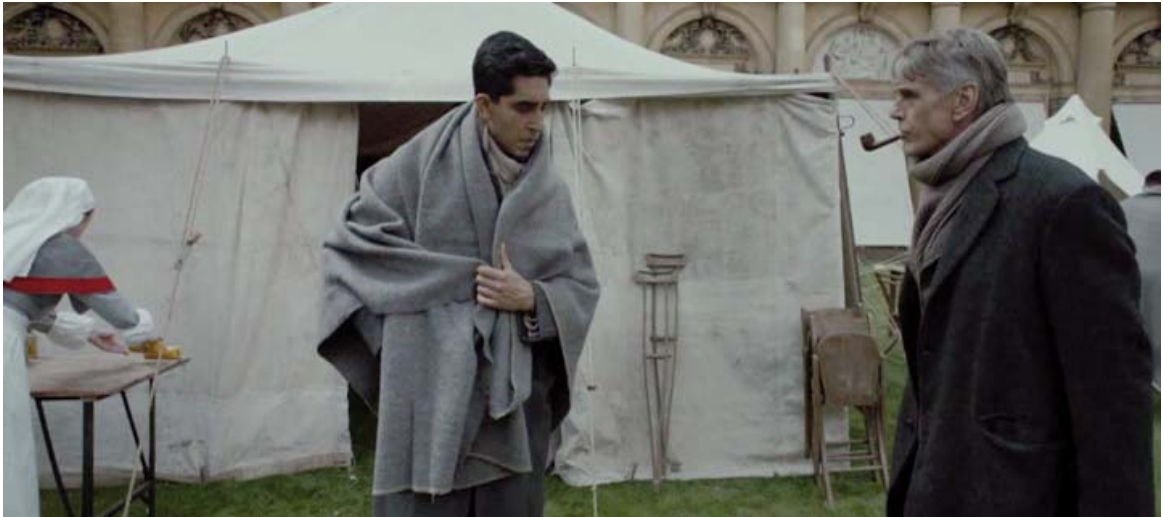
Malaise. (- Hardy "You're not well?").