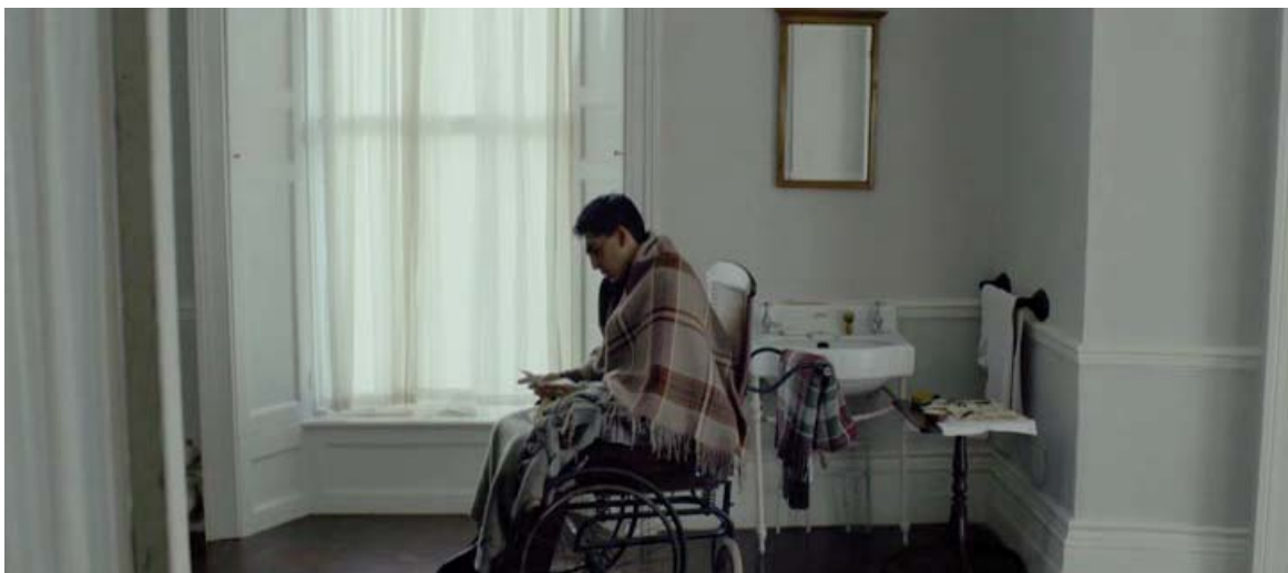
Placement in a sanatorium.