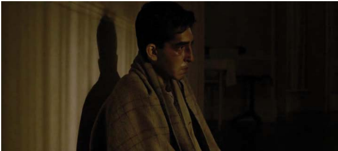
Poor general conditions and weight loss.