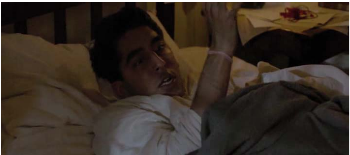
High fever with hallucinations.