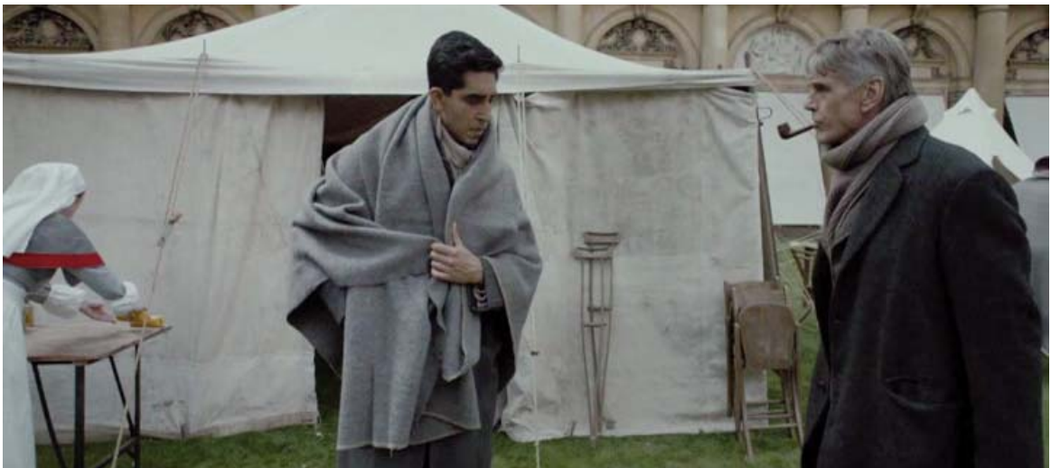
Malaise. (- Hardy "You're not well?").