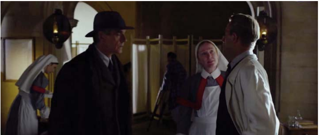
“He came in last night. Not right in the head. Terrible fever”.