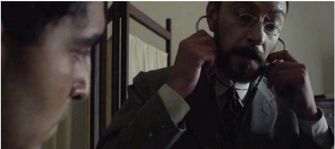
Diagnosis ( "You've all the early signs of tuberculosis" ).