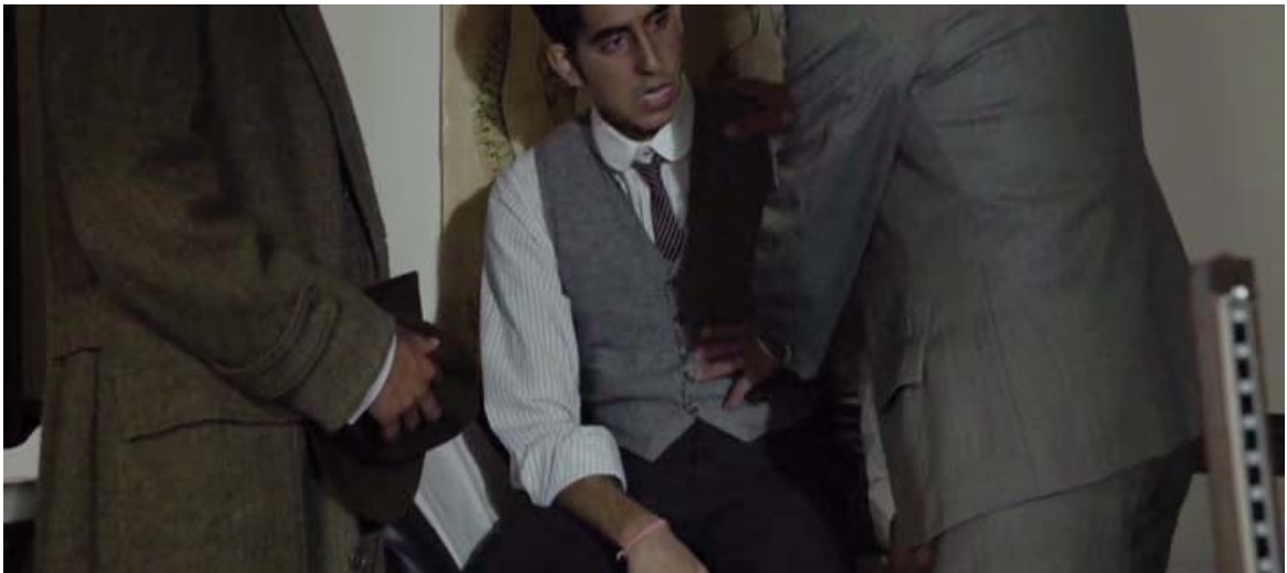
Painful chest palpation.